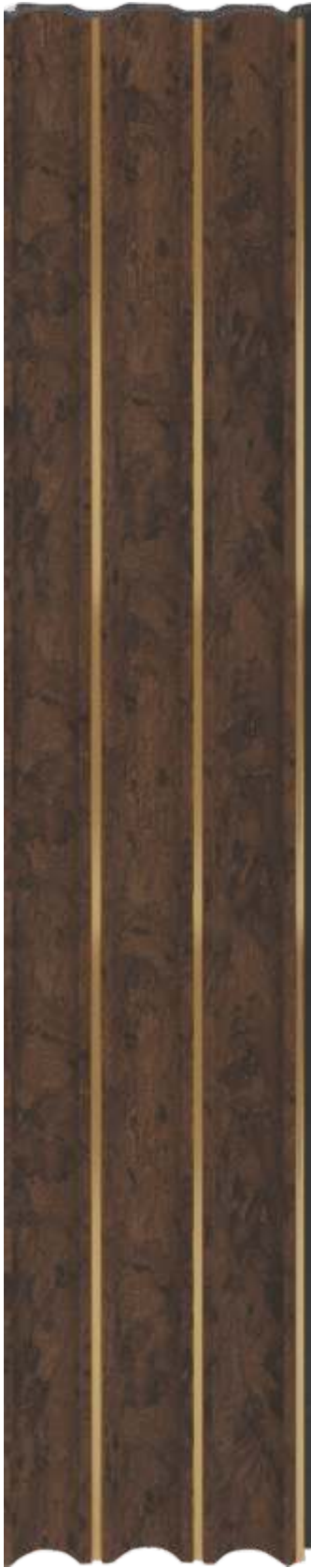
LP - 6009 / 13