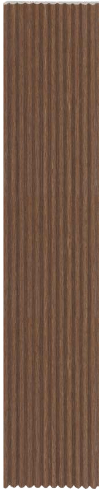
LP - 6012 / 3