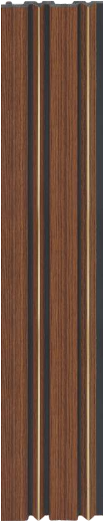
LP - 6010 / 10