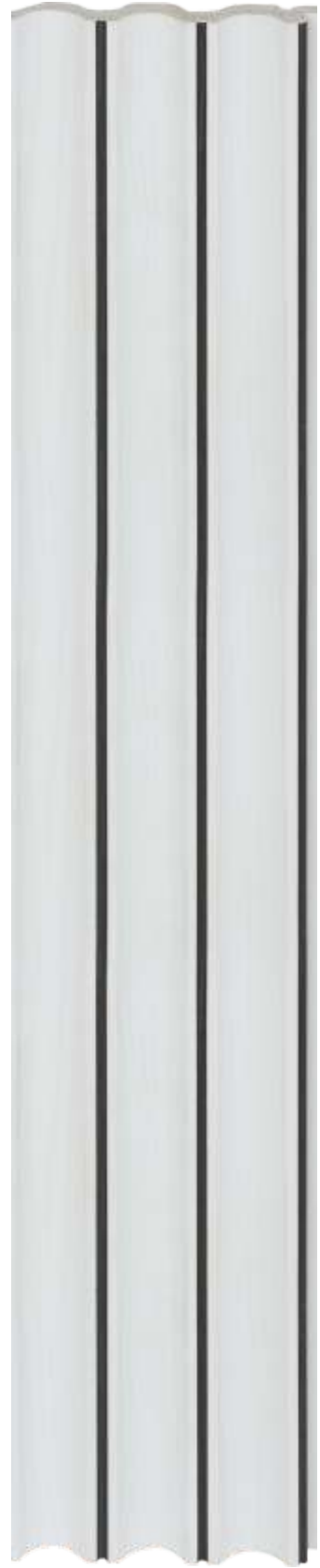
LP - 6009 / 20