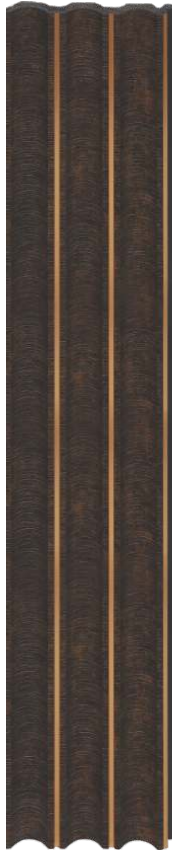
LP - 6009 / 3