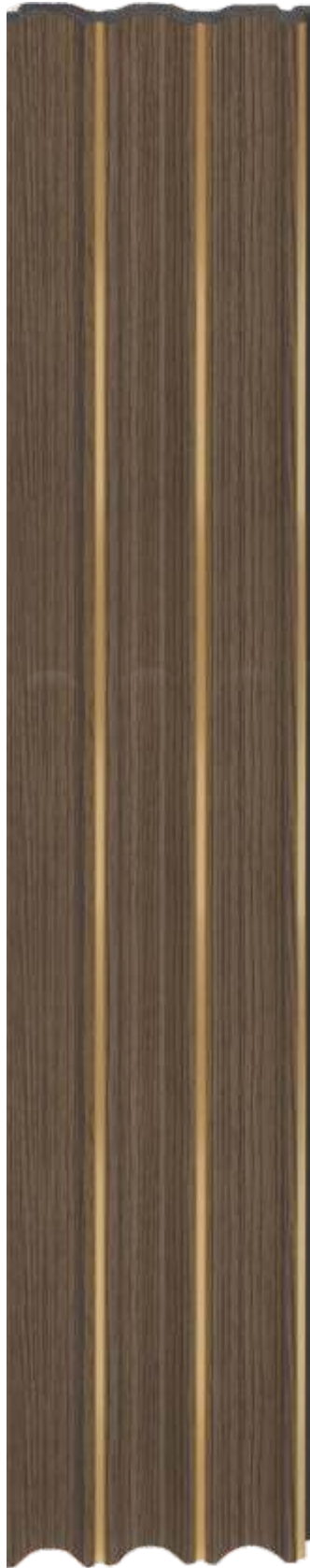
LP - 6009 / 17