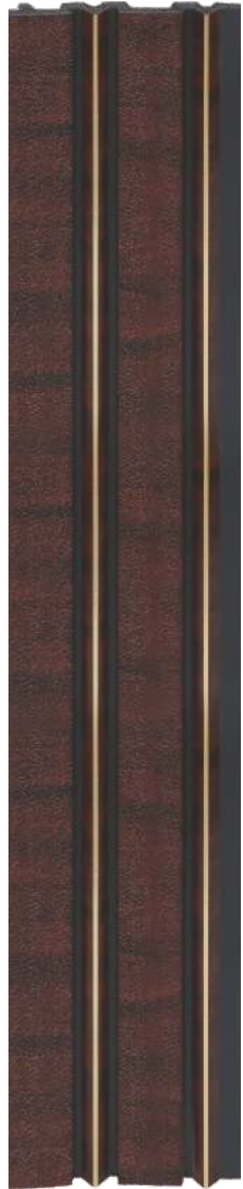
LP - 6010 / 12