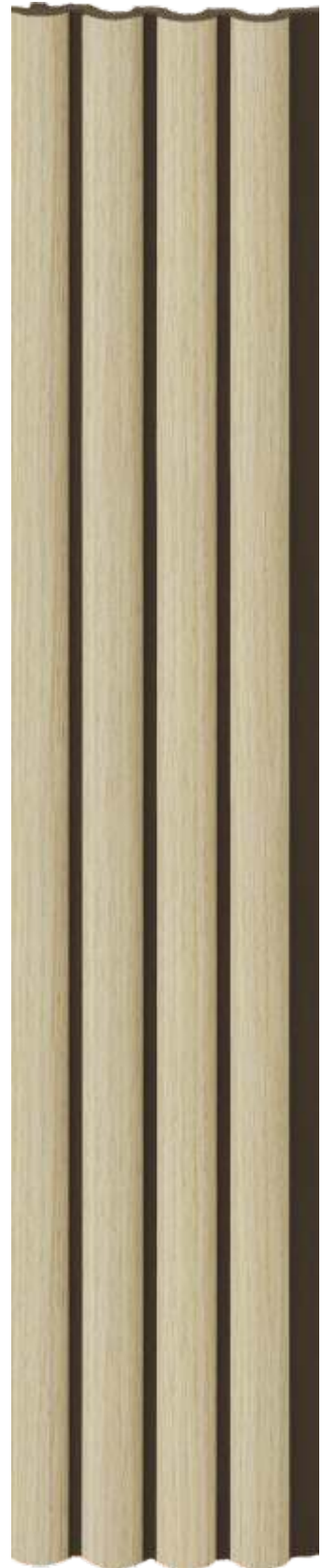
LP - 6011 / 3