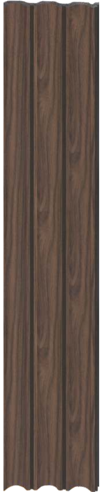
LP - 6009 / 6