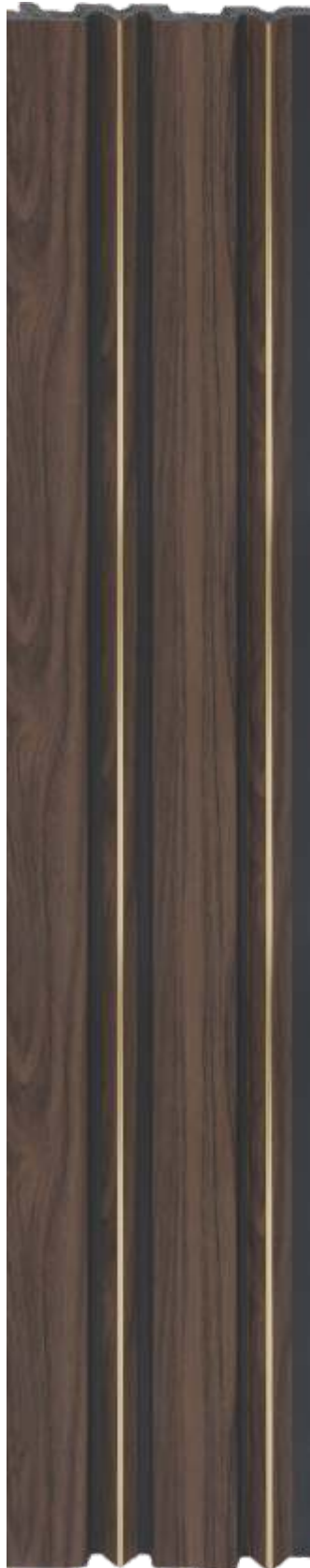
LP - 6010 / 14