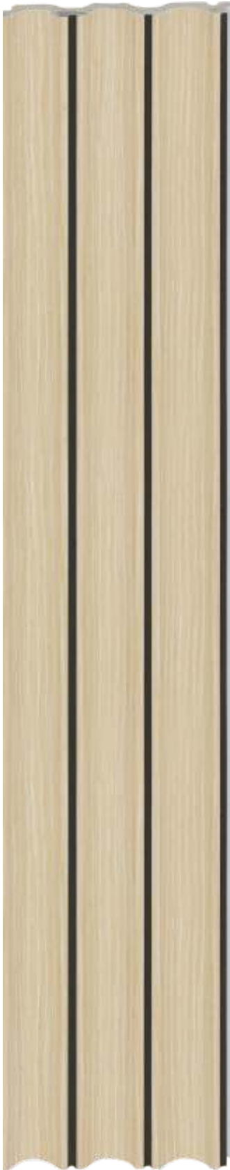
LP - 6009 / 7