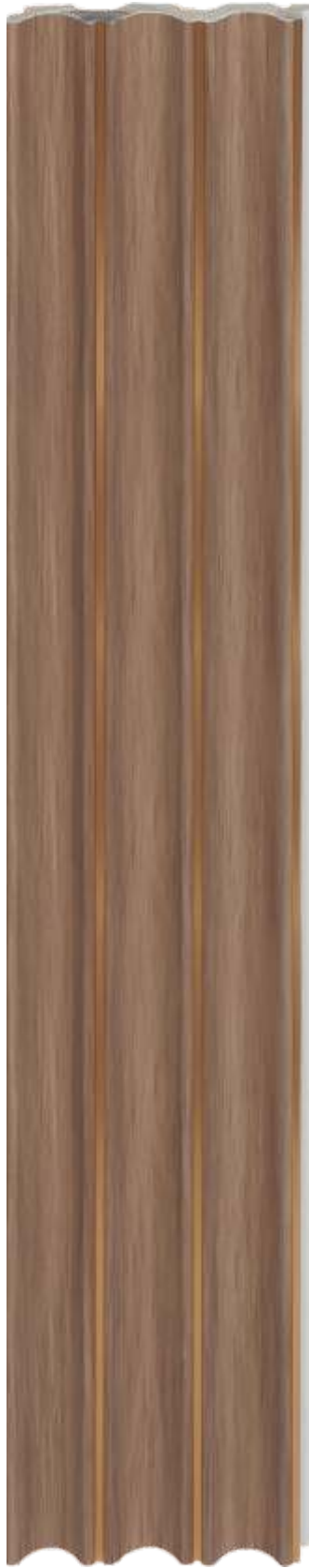
LP - 6009 / 19