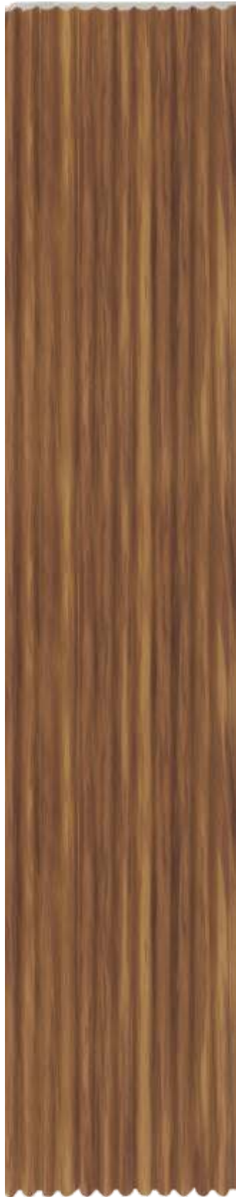
LP - 6012 / 8