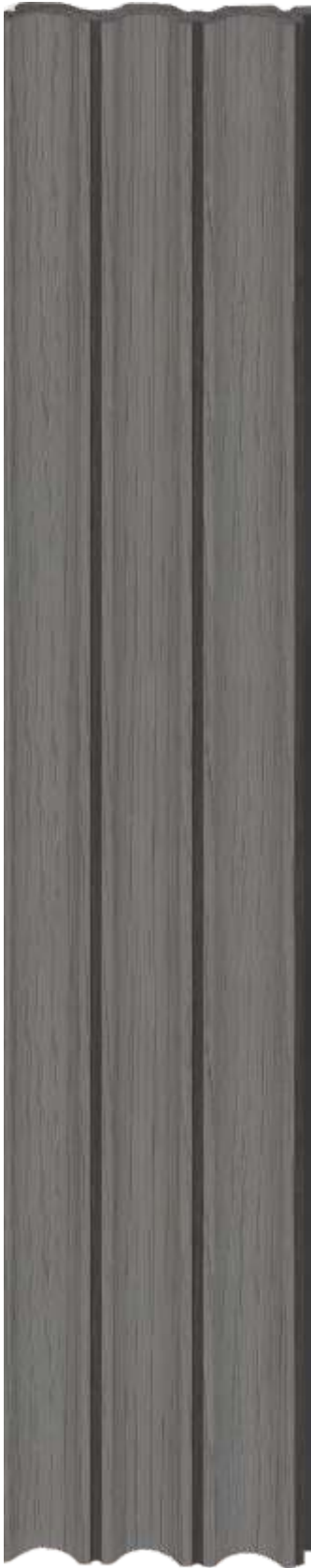
LP - 6009 / 10