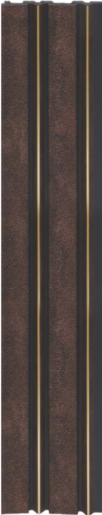
LP - 6010 / 13