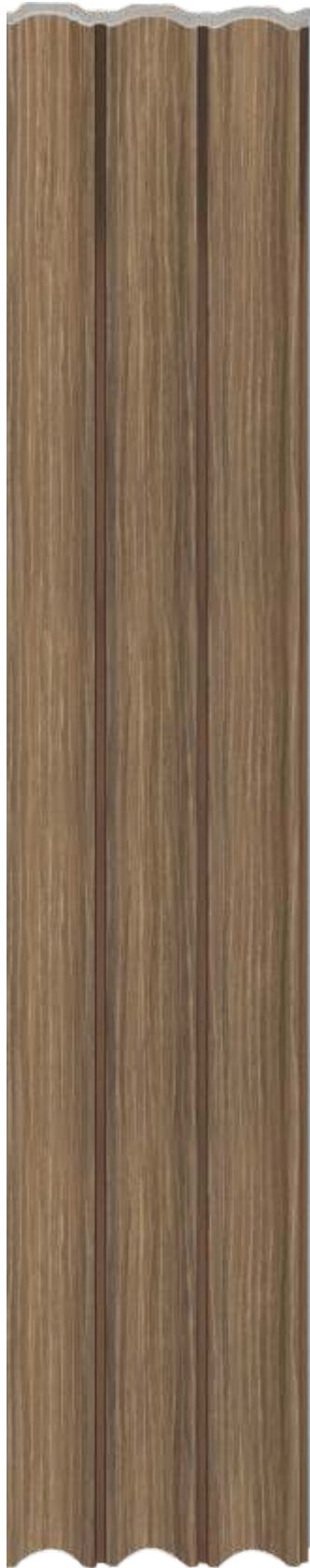
LP - 6009 / 11