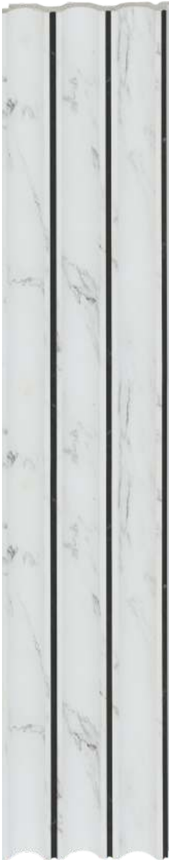
LP - 6009 / 1