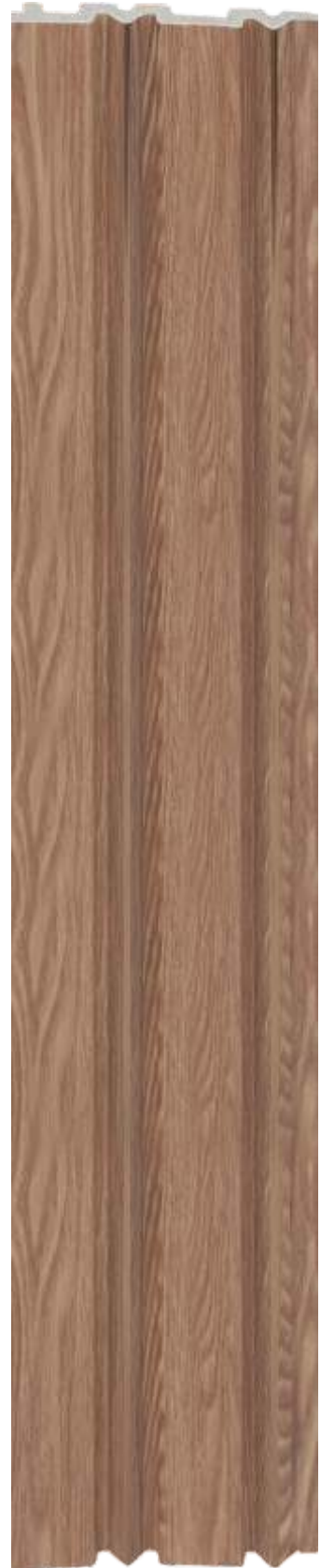
LP - 6010 / 3