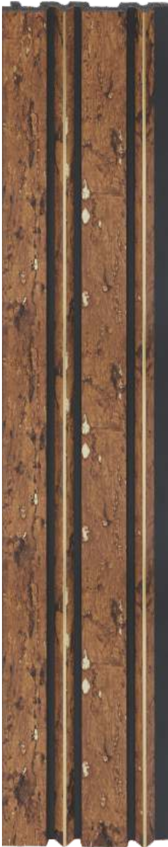
LP - 6010 / 1