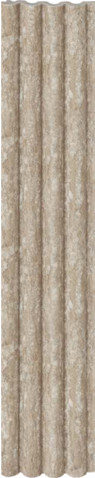
LP - 6011 / 10