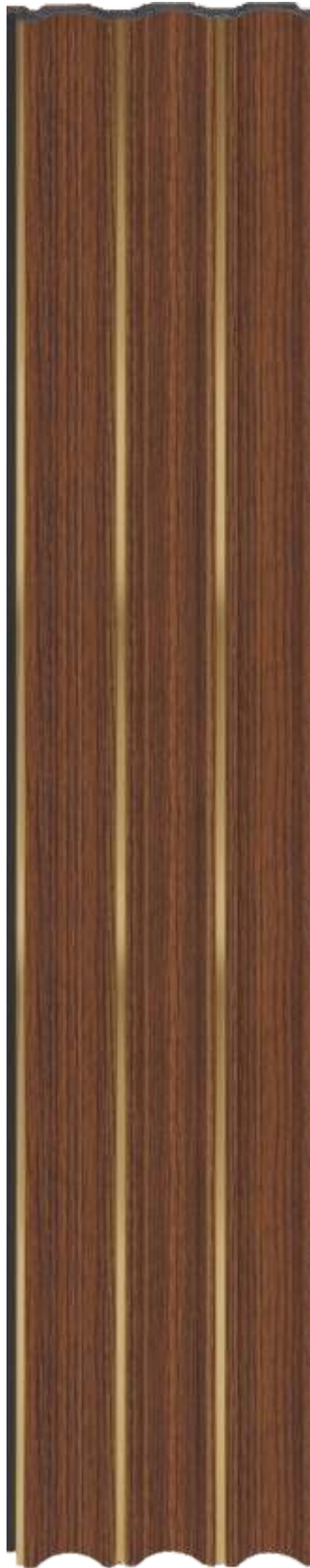
LP - 6009 / 8