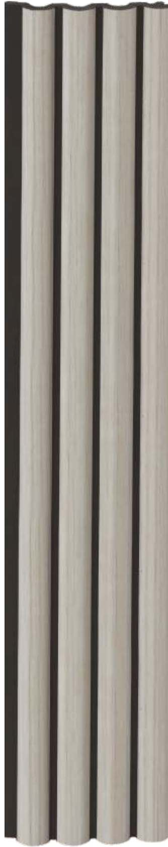
LP - 6011 / 16