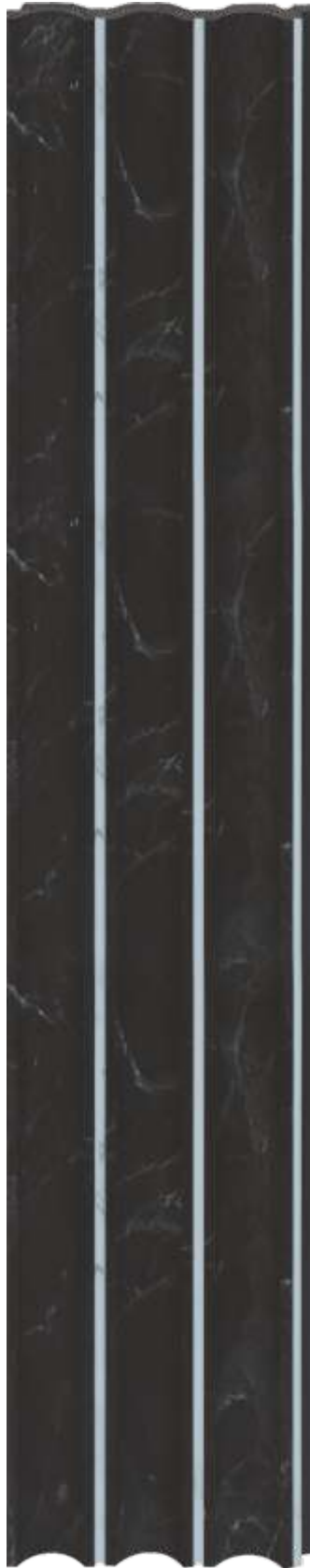
LP - 6009 / 2