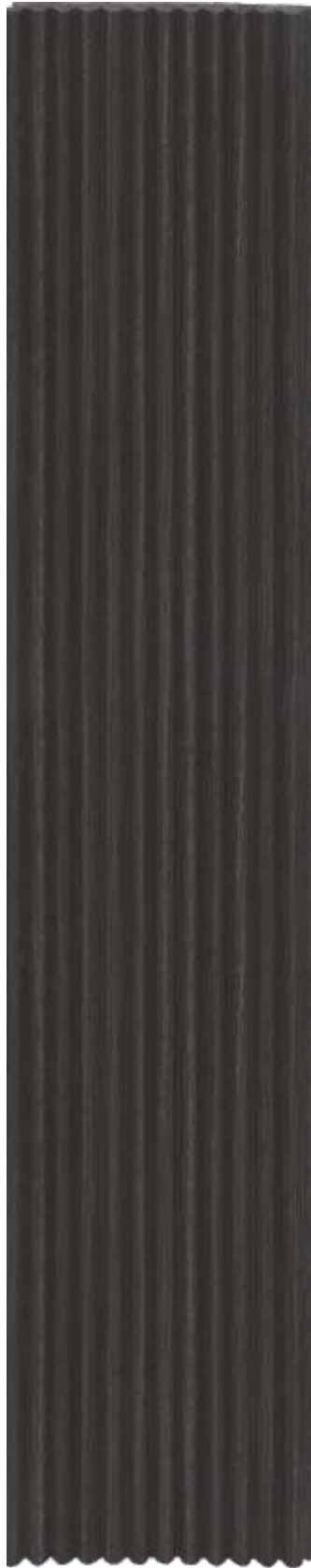
LP - 6012 / 2