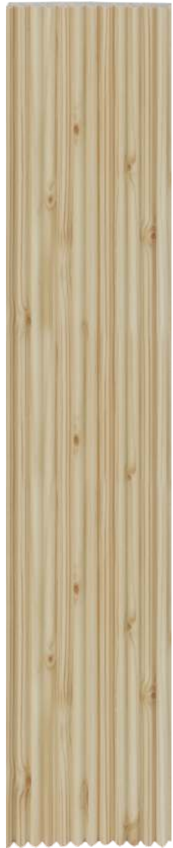
LP - 6012 / 9