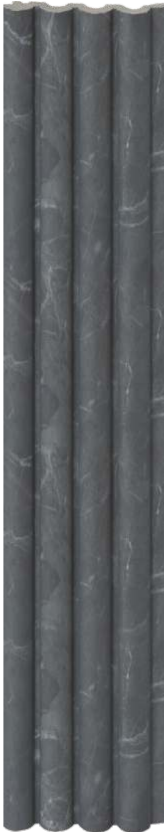
LP - 6011 / 14