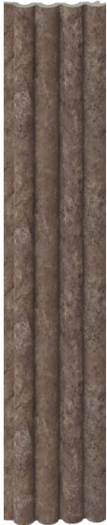
LP - 6011 / 15