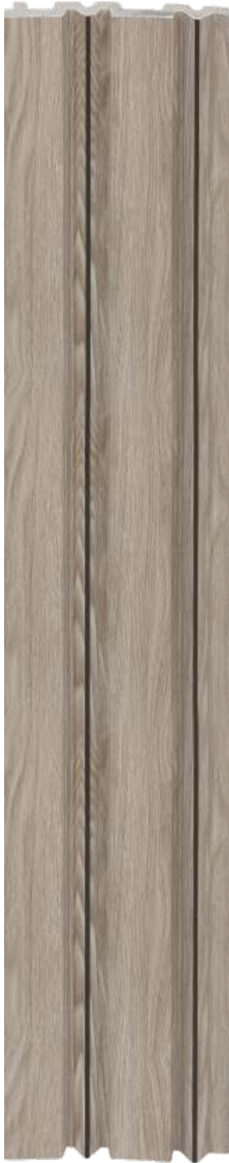
LP - 6010 / 8