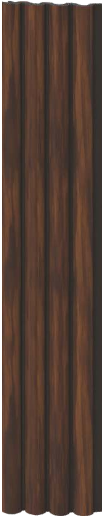
LP - 6011 / 5