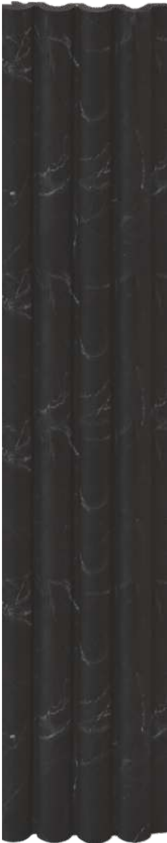
LP - 6011 / 13