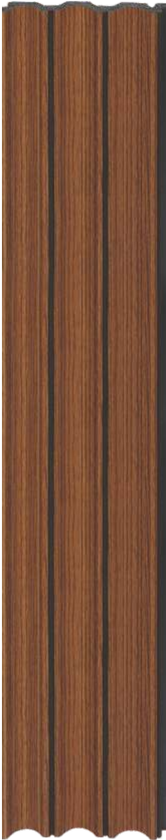
LP - 6009 / 16