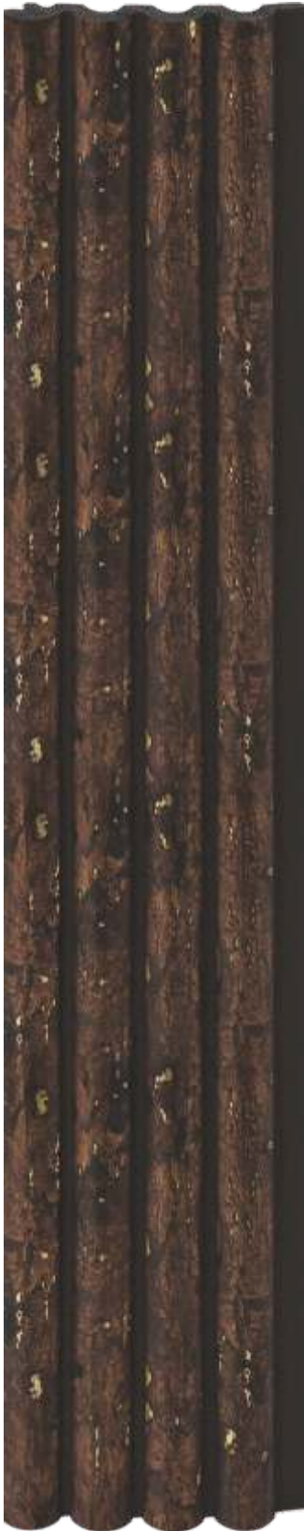
LP - 6011 / 1