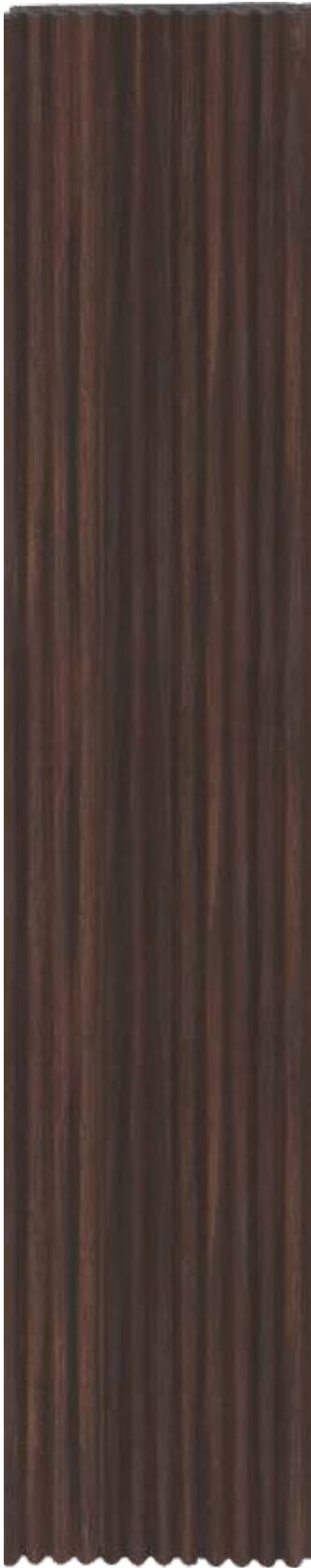
LP - 6012 / 7