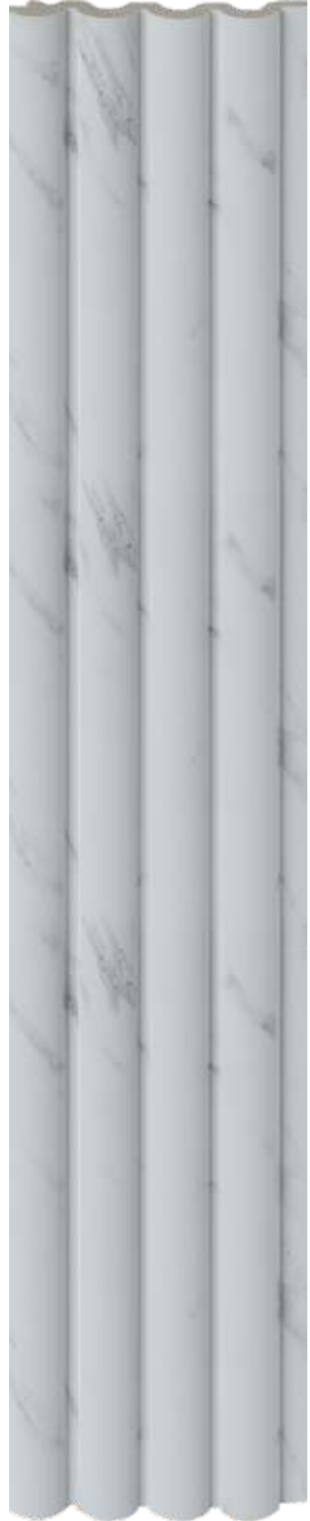
LP - 6011 / 12