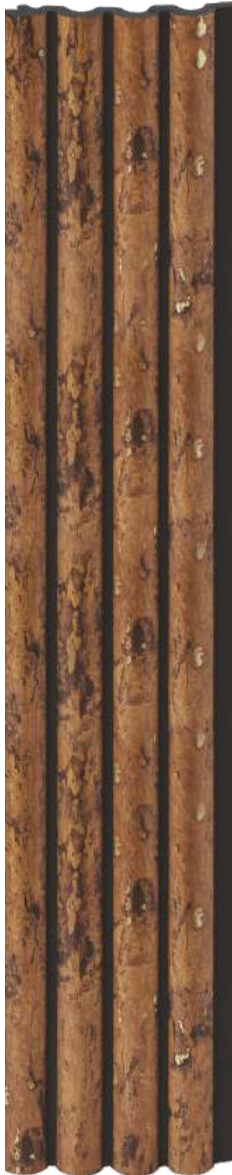
LP - 6011 / 2