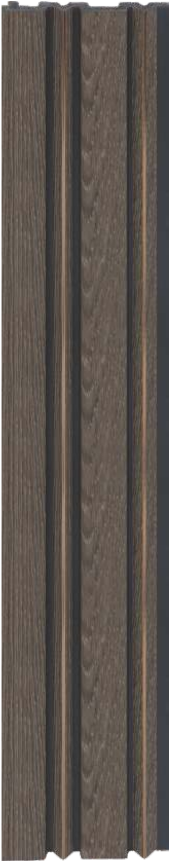
LP - 6010 / 7