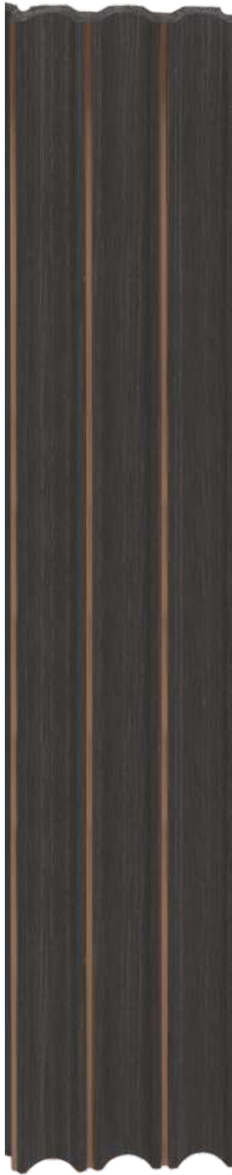
LP - 6009 / 14