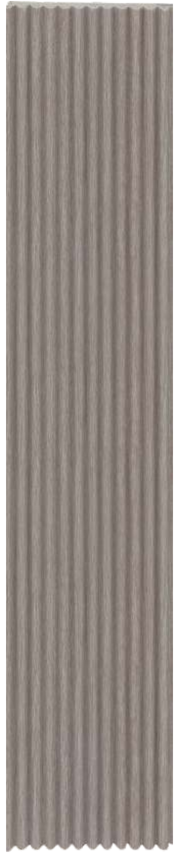
LP - 6012 / 11