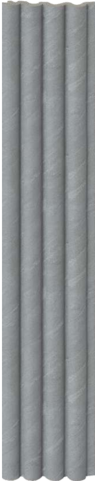
LP - 6011 / 8