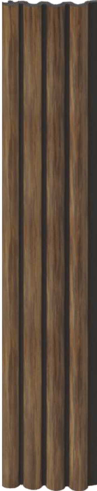
LP - 6011 / 11