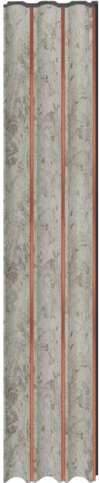
LP - 6009 / 12