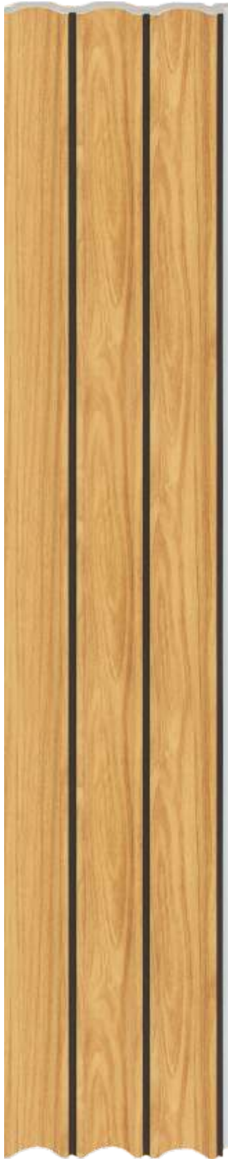
LP - 6009 / 5