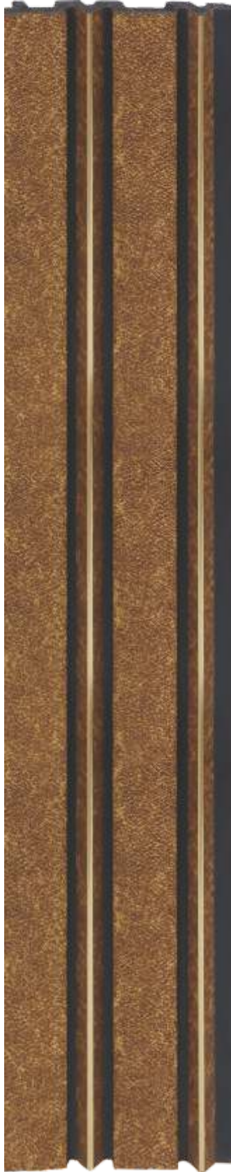
LP - 6010 / 5