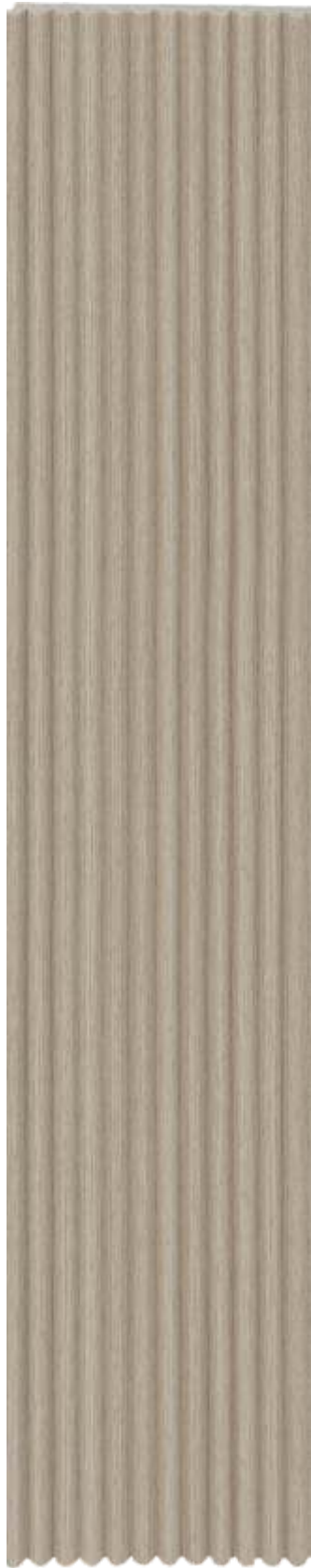
LP - 6012 / 5