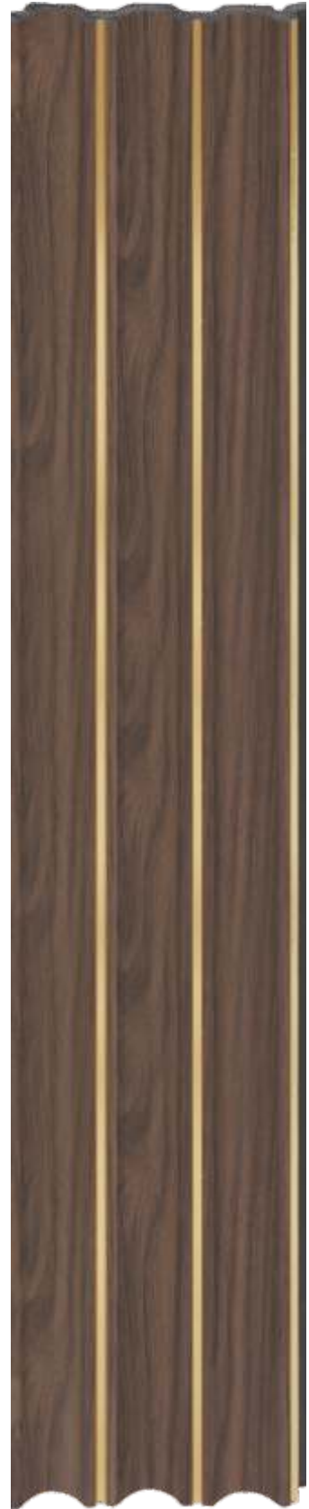
LP - 6009 / 18