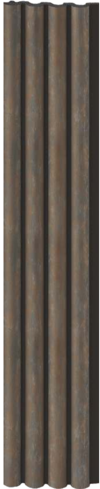
LP - 6011 / 9