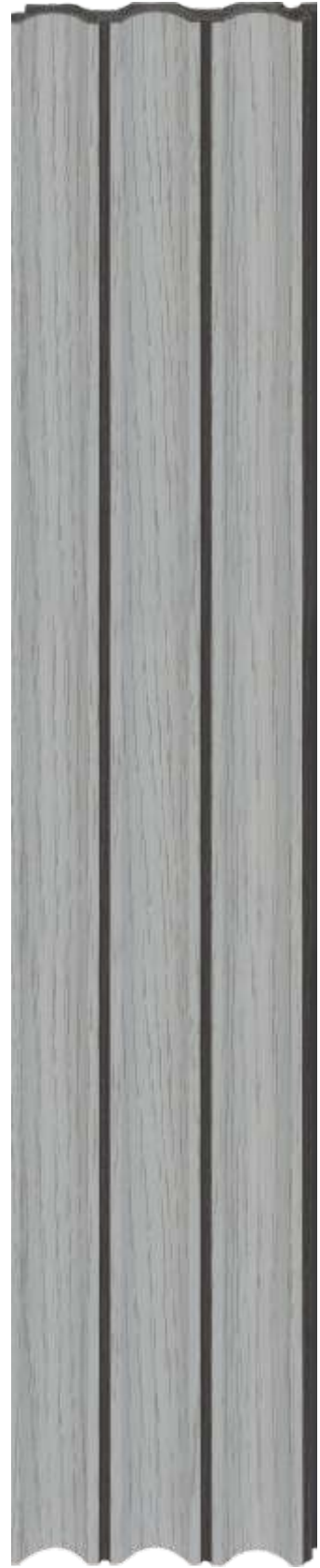
LP - 6009 / 15