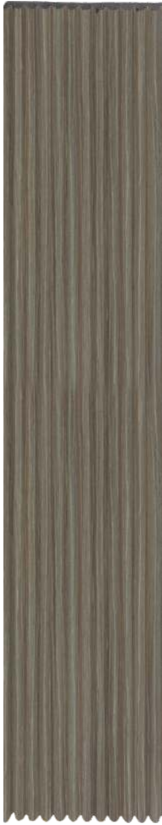
LP - 6012 / 10