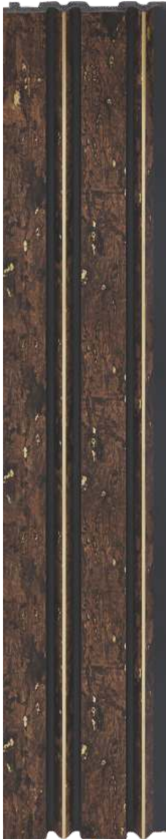
LP - 6010 / 2