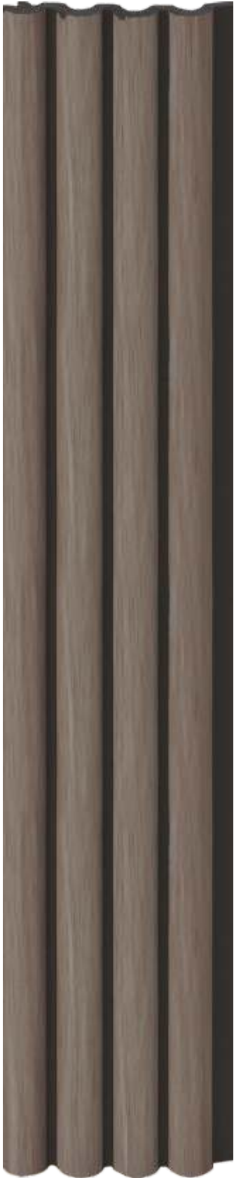
LP - 6011 / 4