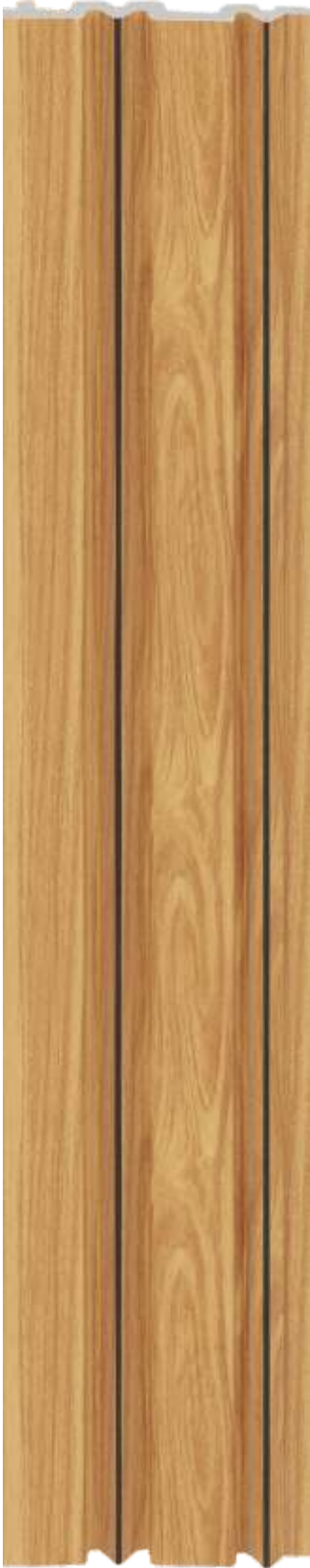
LP - 6010 / 4