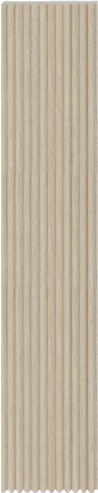
LP - 6012 / 4