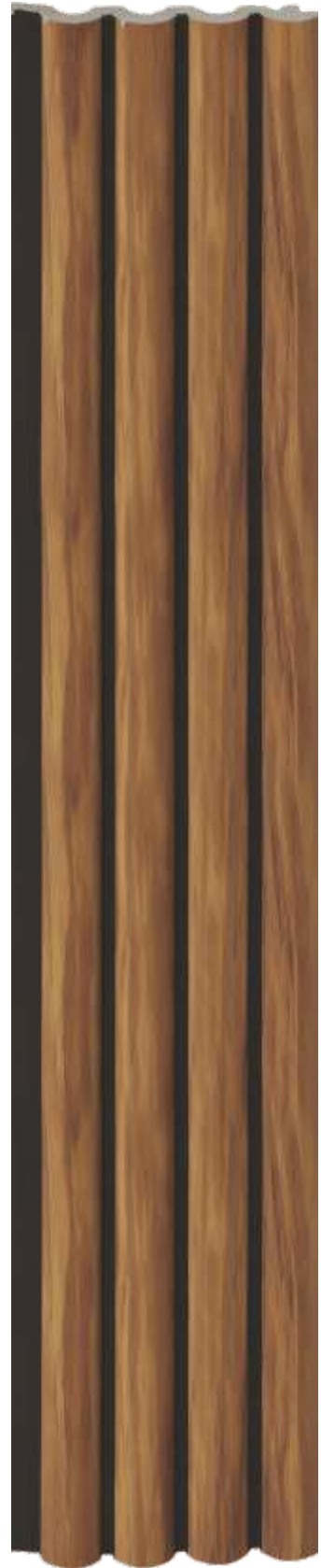
LP - 6011 / 6