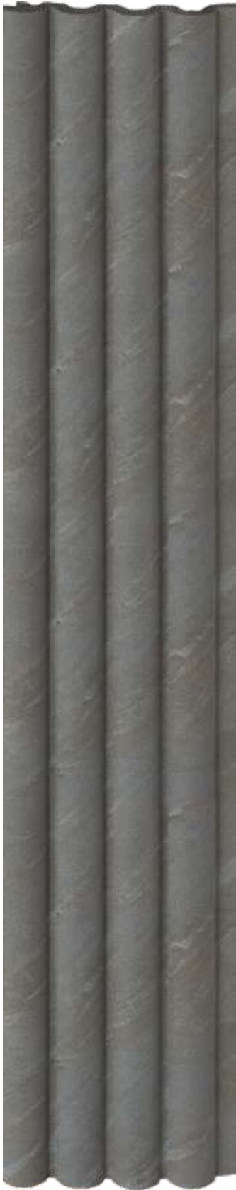
LP - 6011 / 7