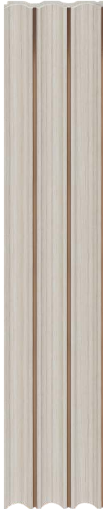
LP - 6009 / 9