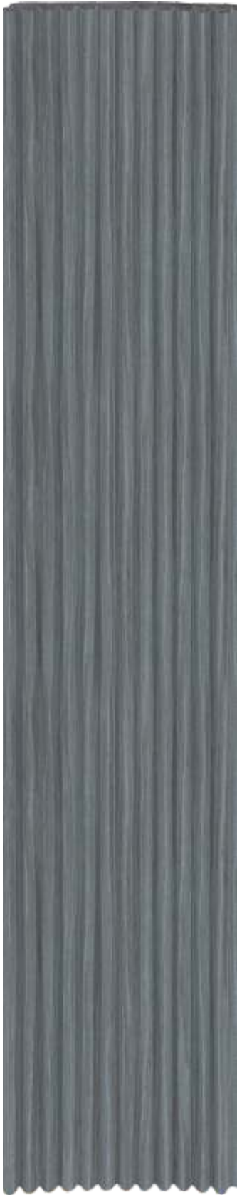
LP - 6012 / 1