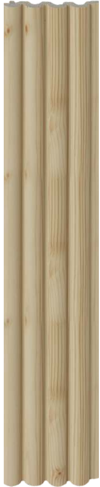
LP - 6011 / 17