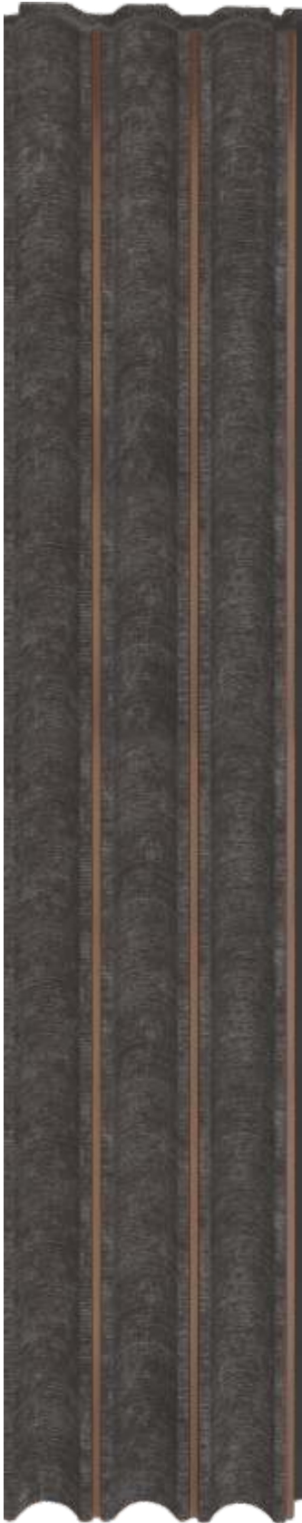
LP - 6009 / 4