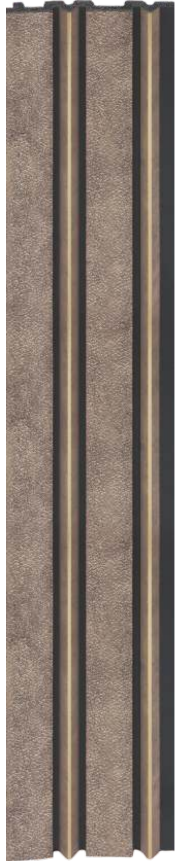
LP - 6010 / 6