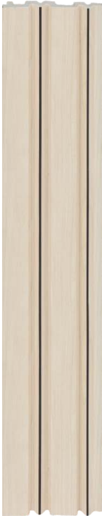
LP - 6010 / 11