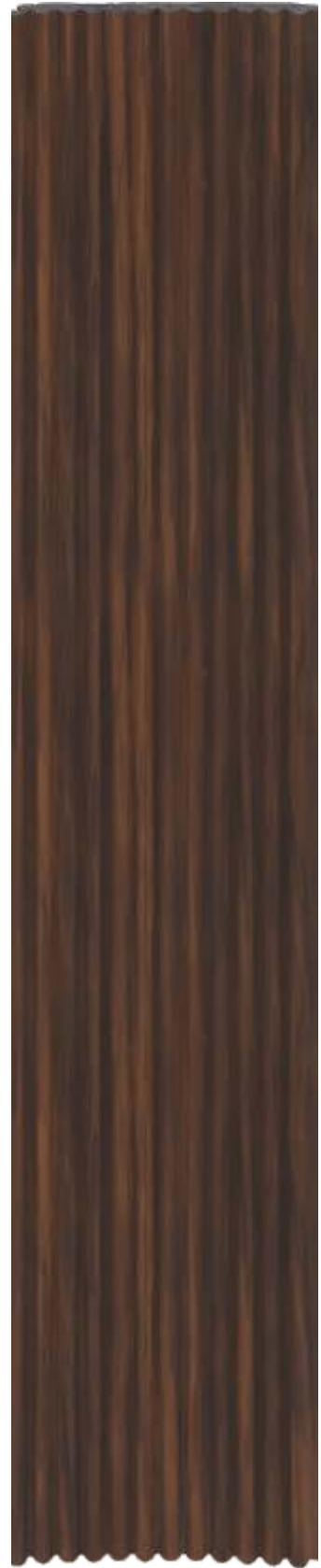
LP - 6012 / 6