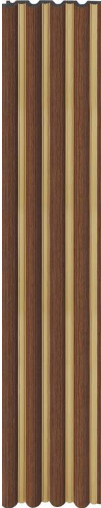
LP - 6003 / 14