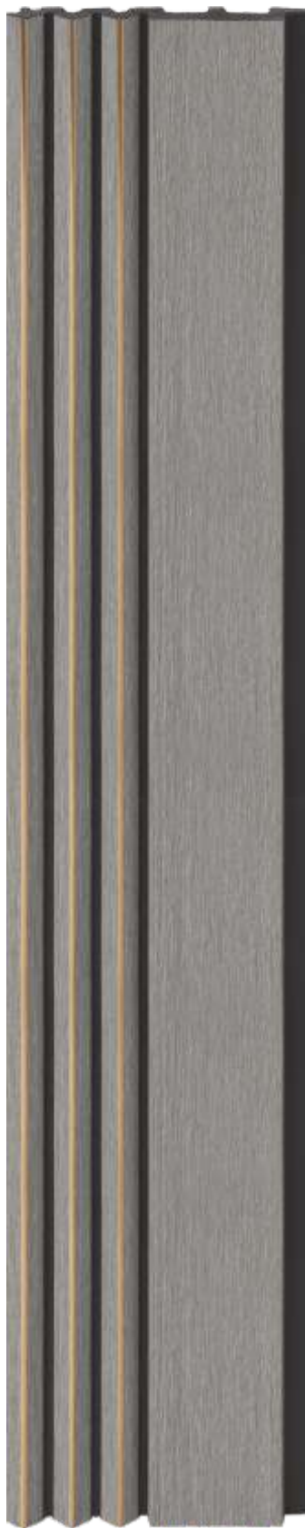
LP - 6001 / 4