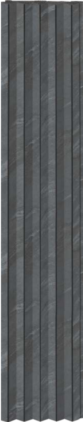
LP - 6004 / 4