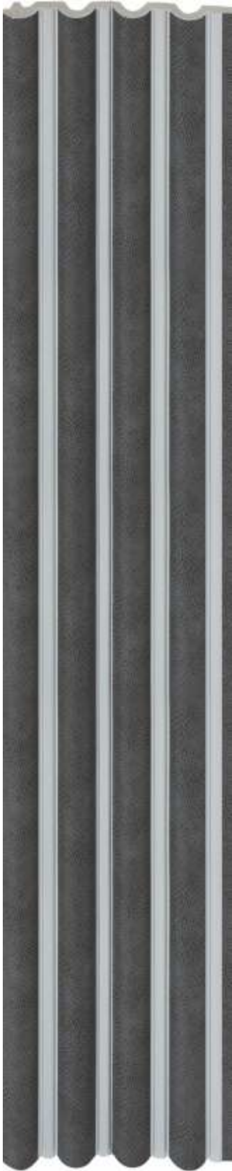
LP - 6003 / 13