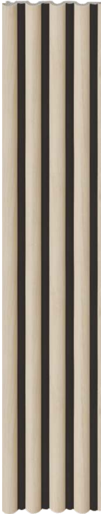
LP - 6003 / 2