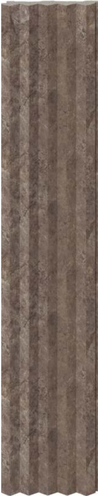
LP - 6004 / 16