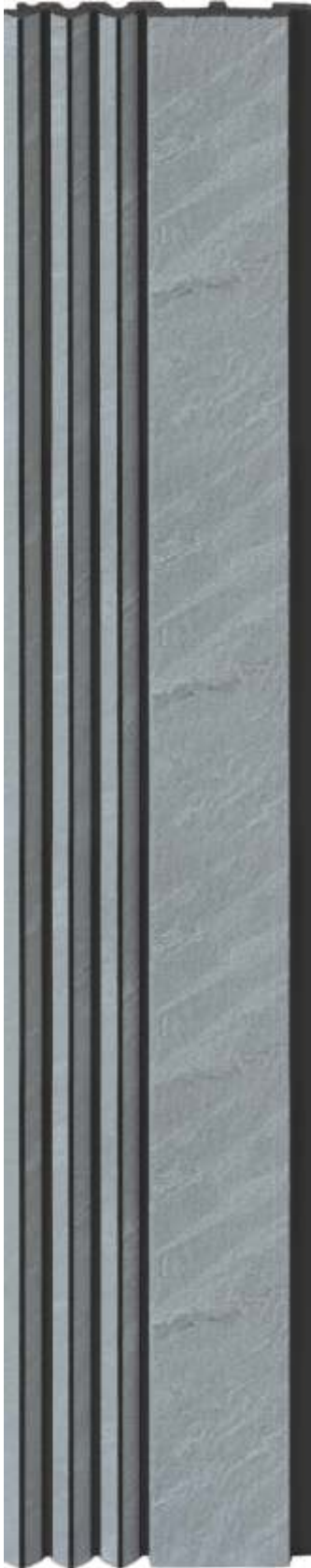
LP - 6001 / 13