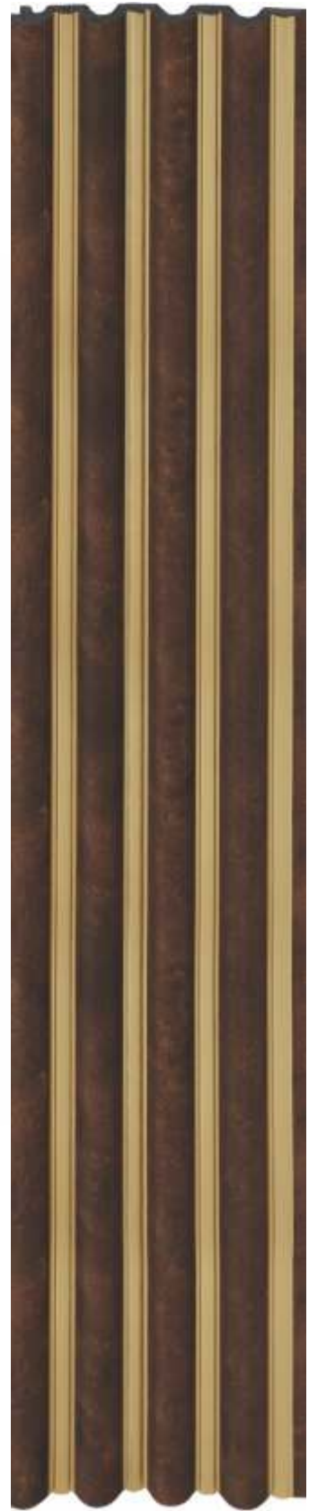
LP - 6003 / 12