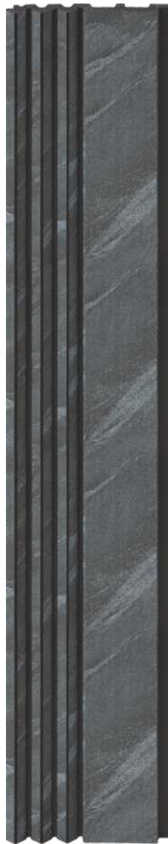
LP - 6001 / 6