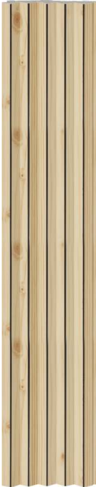
LP - 6004 / 23