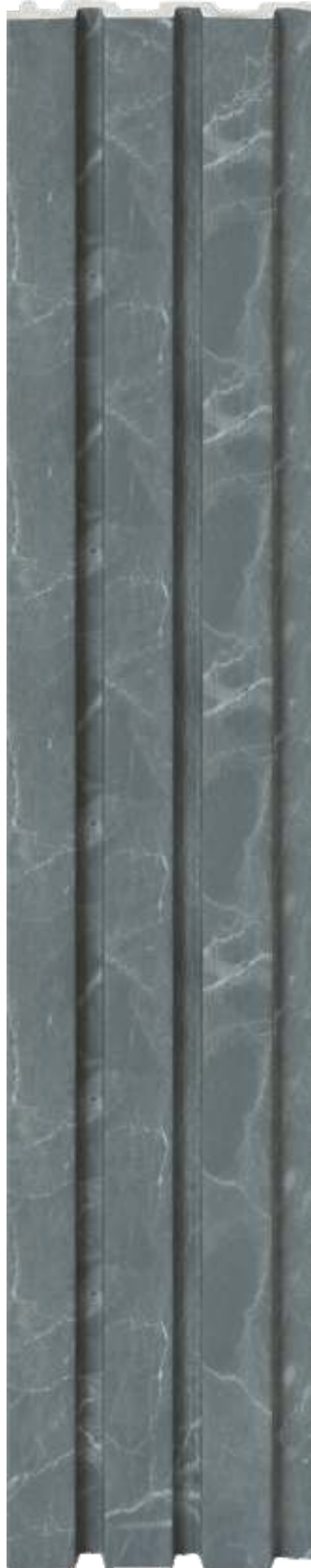
LP - 6002 / 2