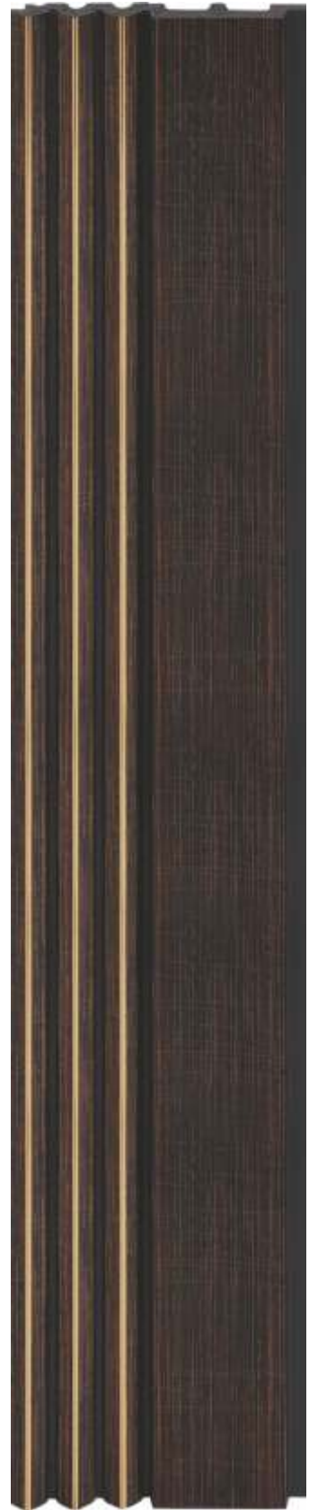
LP - 6001 / 12