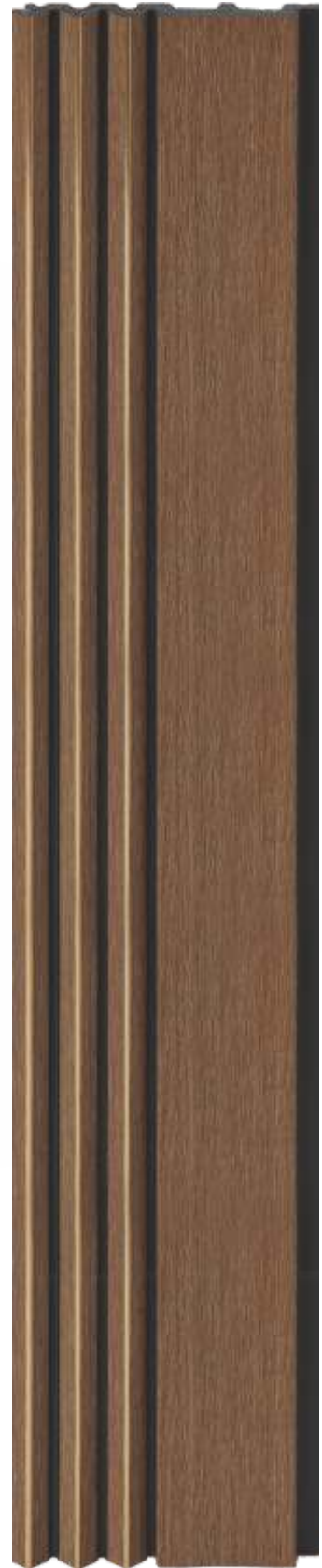
LP - 6001 / 3