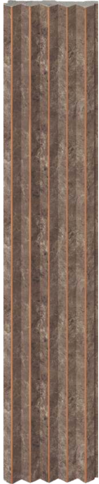
LP - 6004 / 9