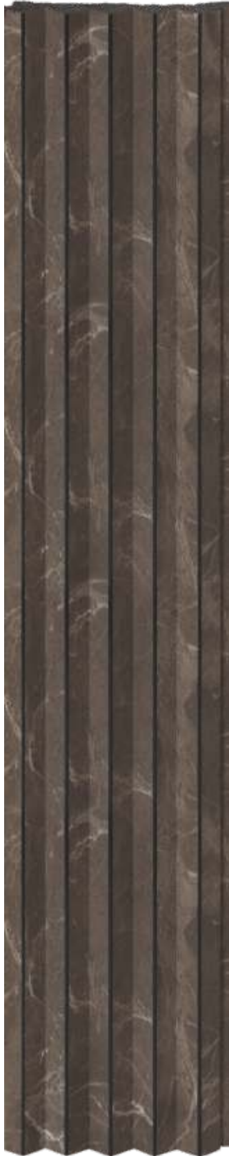
LP - 6004 / 8