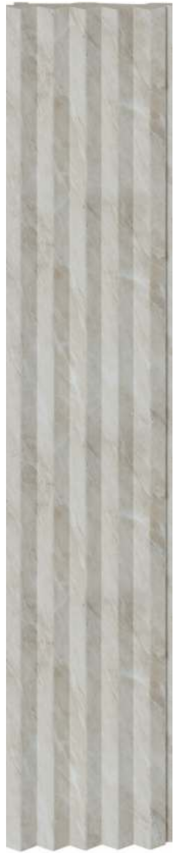
LP - 6004 / 12