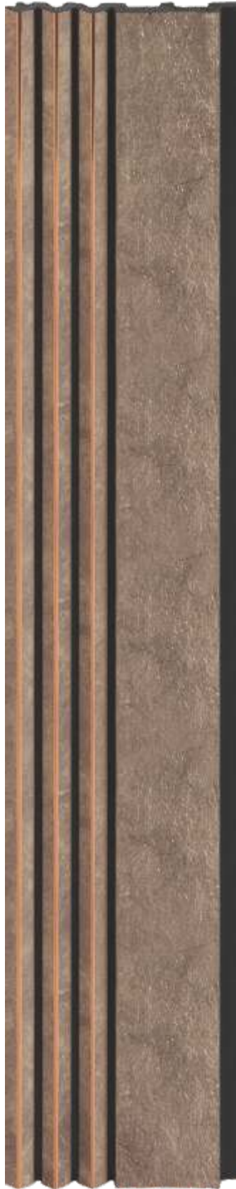
LP - 6001 / 8