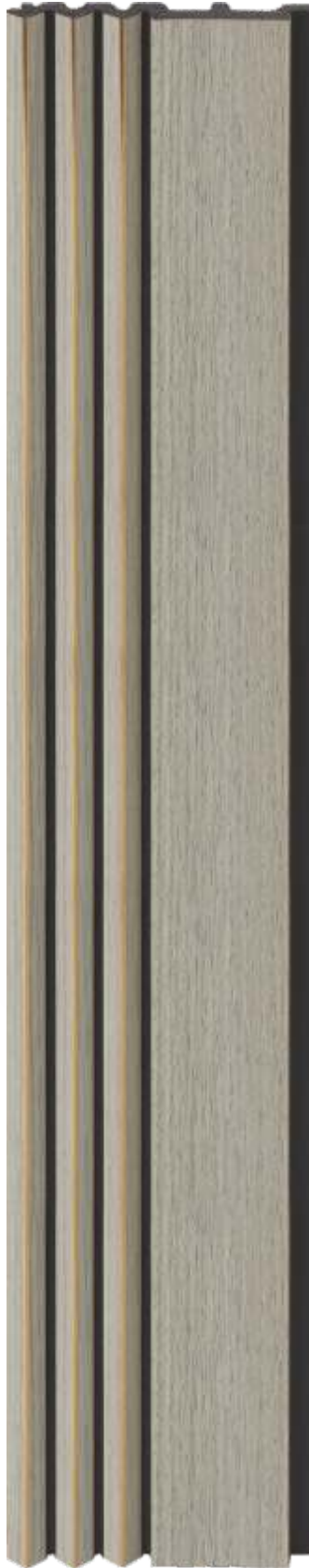
LP - 6001 / 2