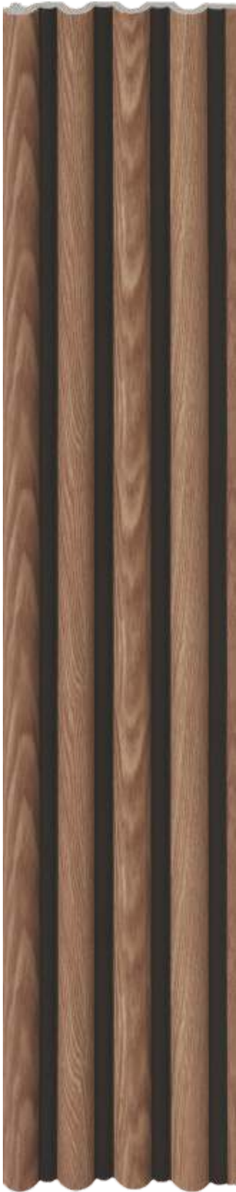
LP - 6003 / 1