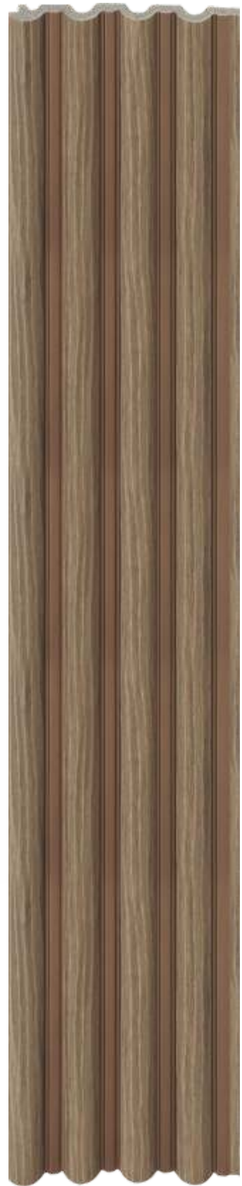
LP - 6003 / 6