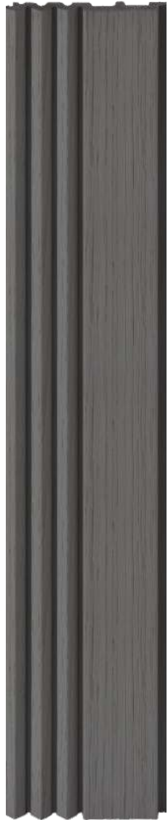
LP - 6001 / 9