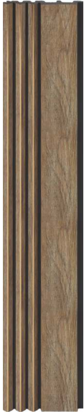
LP - 6001 / 15