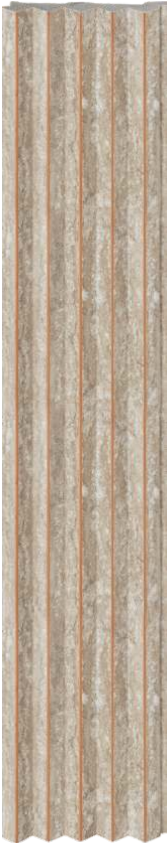
LP - 6004 / 10