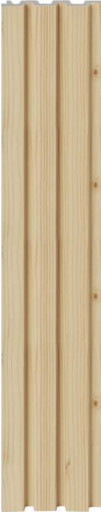
LP - 6002 / 13