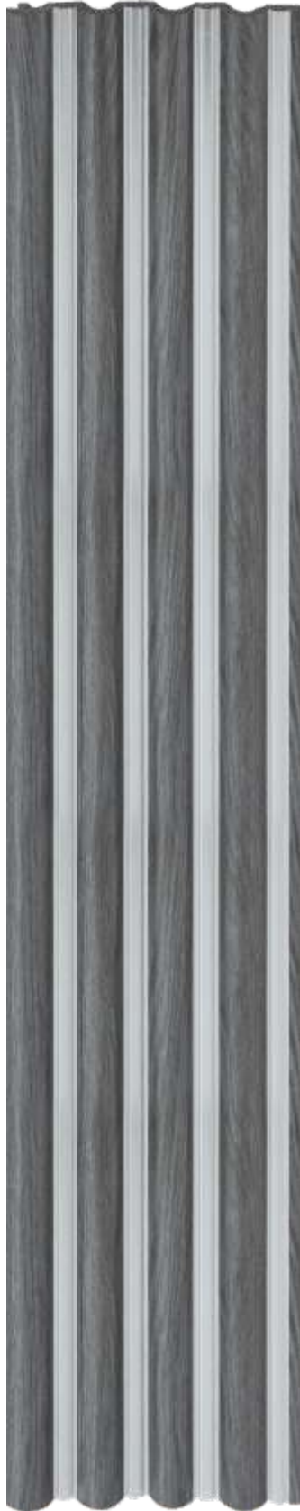
LP - 6003 / 8