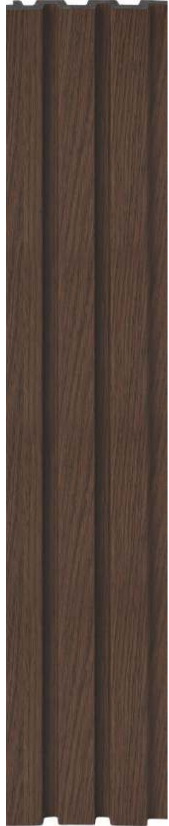
LP - 6002 / 15