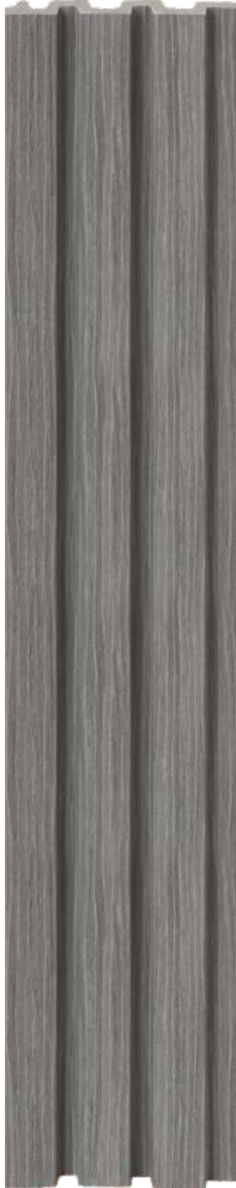
LP - 6002 / 5