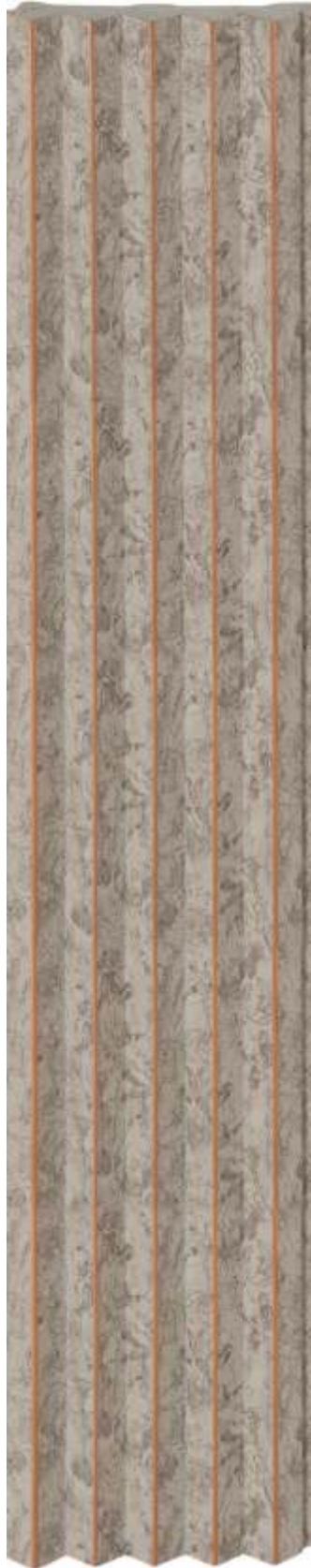
LP - 6004 / 25