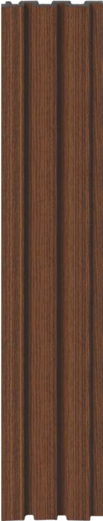
LP - 6002 / 7