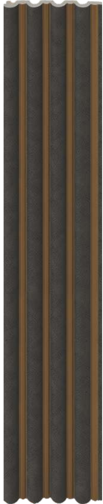
LP - 6003 / 9