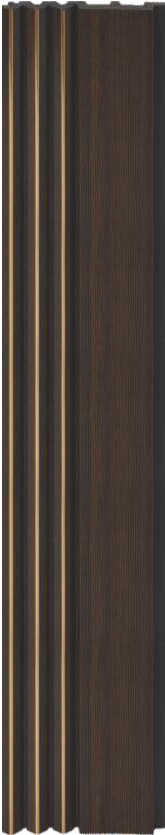
LP - 6001 / 10