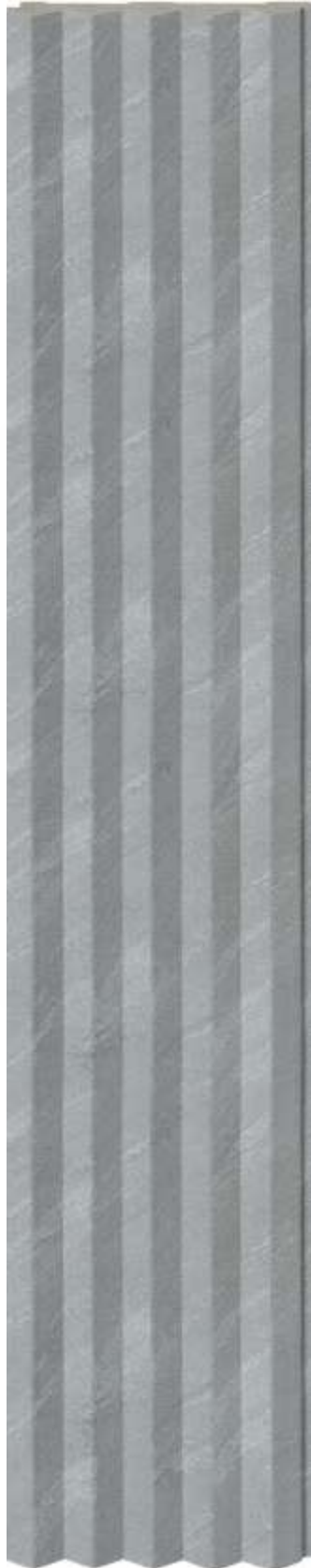
LP - 6004 / 17