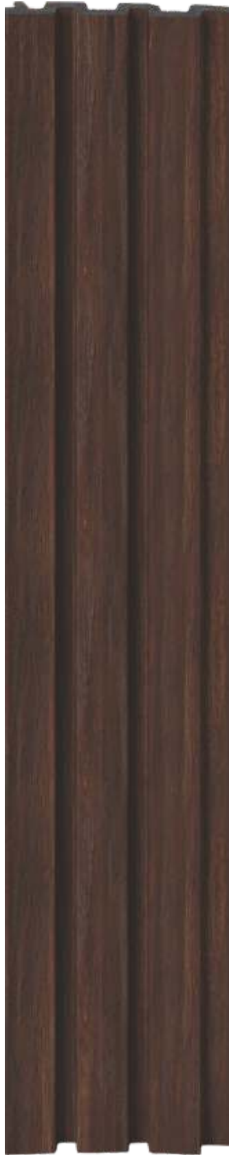
LP - 6002 / 11