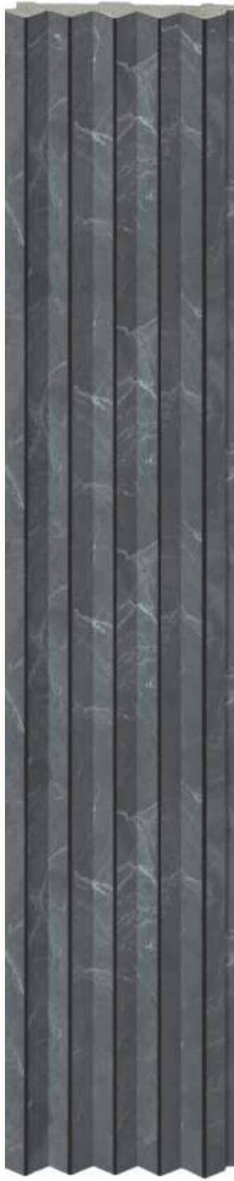
LP - 6004 / 20