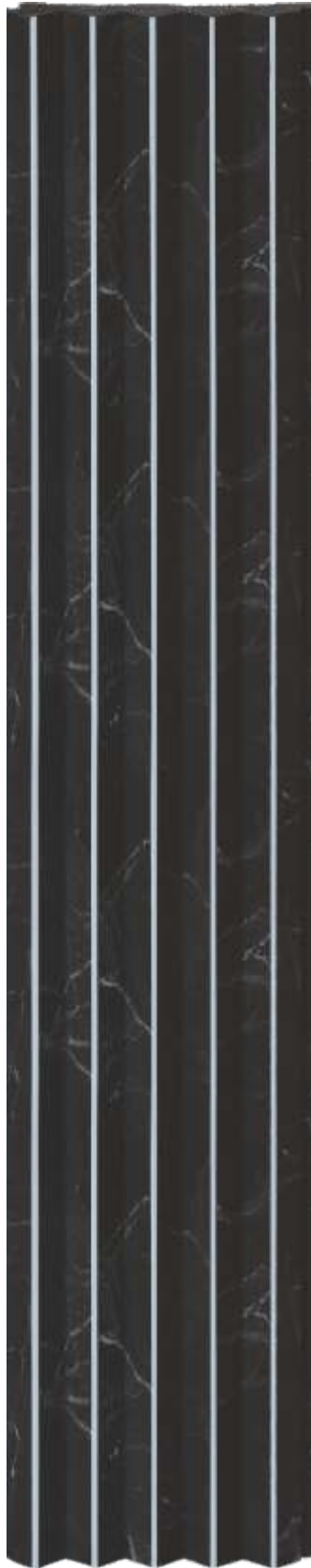
LP - 6004 / 2