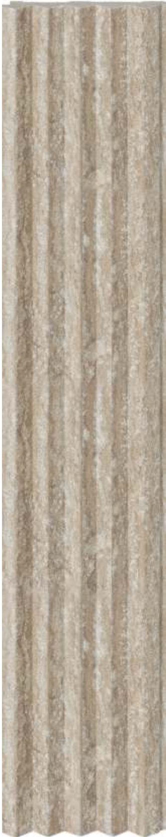
LP - 6004 / 19