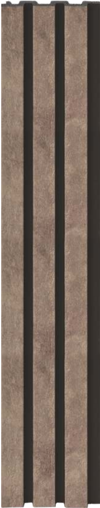
LP - 6002 / 10