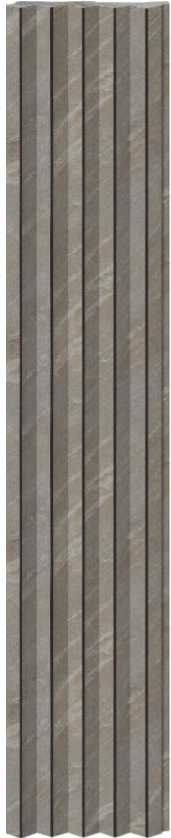
LP - 6004 / 3