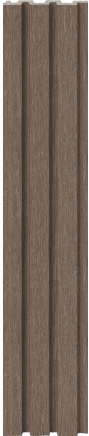
LP - 6002 / 3