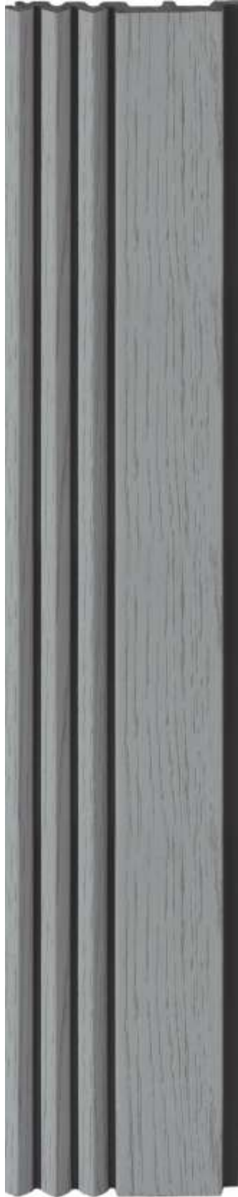
LP - 6001 / 14