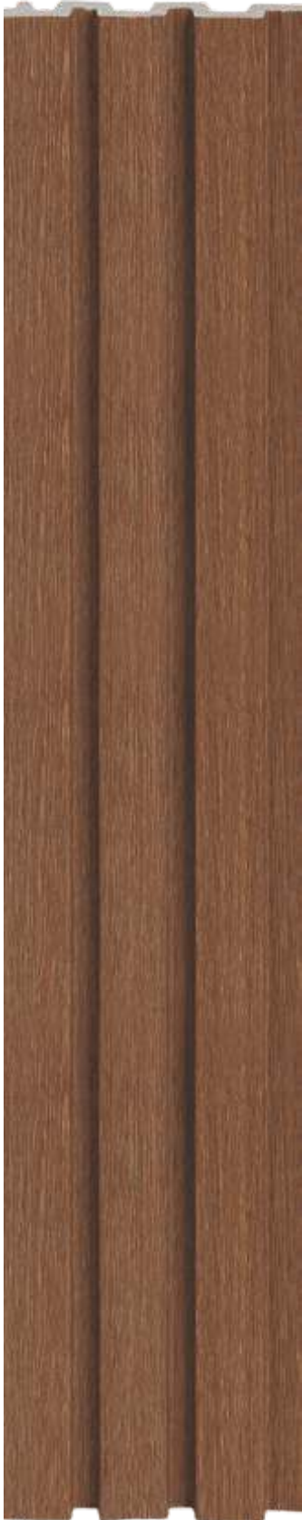
LP - 6002 / 4