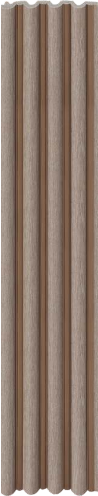
LP - 6003 / 7