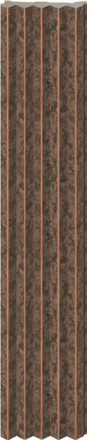
LP - 6004 / 22