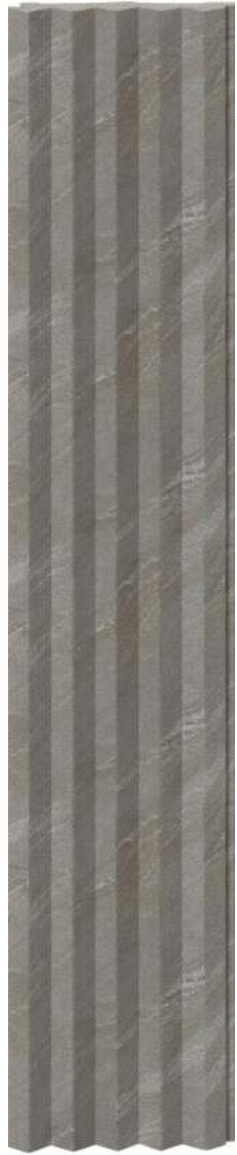
LP - 6004 / 21