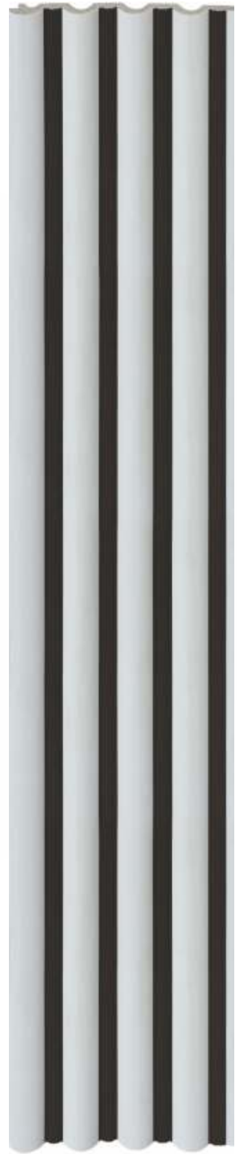
LP - 6003 / 17