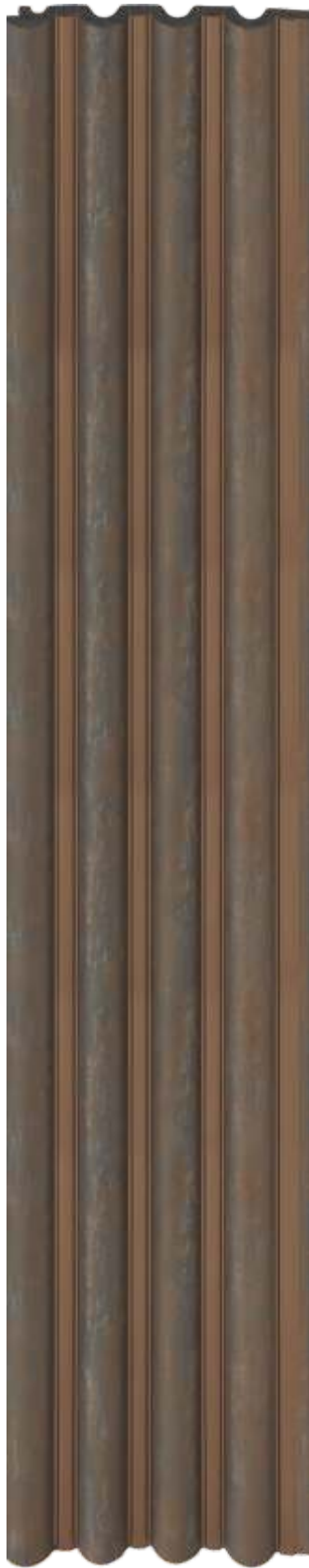
LP - 6003 / 5