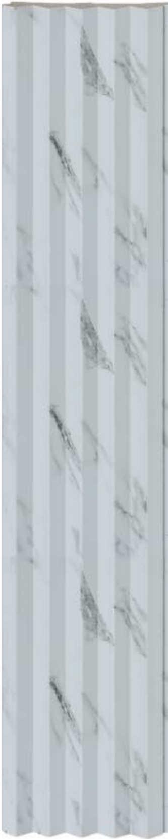
LP - 6004 / 13