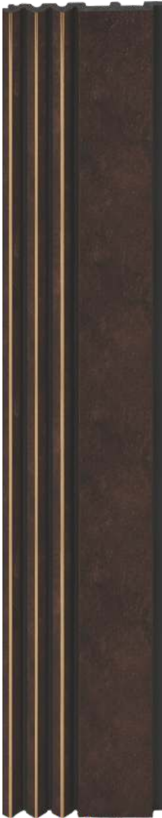
LP - 6001 / 7