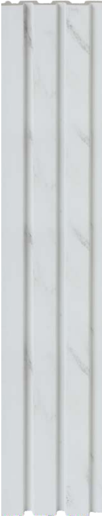
LP - 6002 / 1