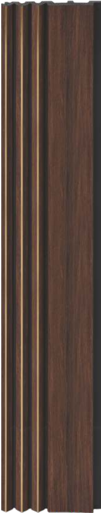
LP - 6001 / 1