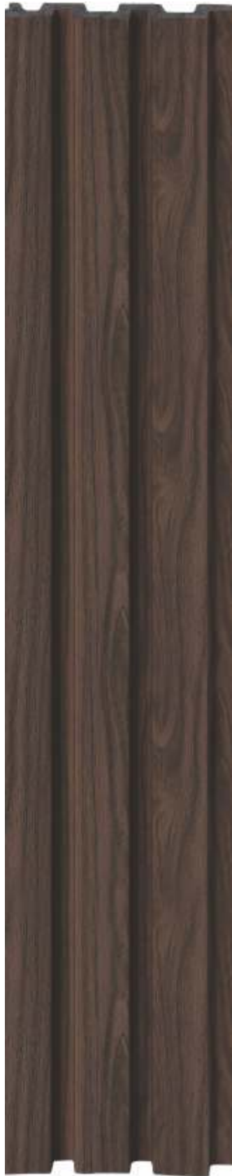
LP - 6002 / 16