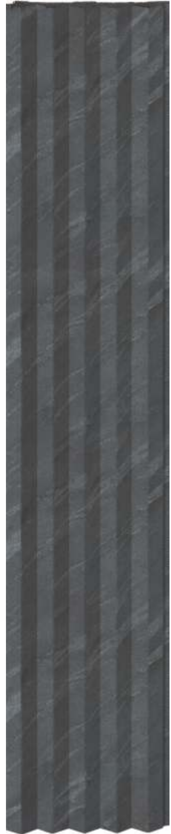
LP - 6004 / 24