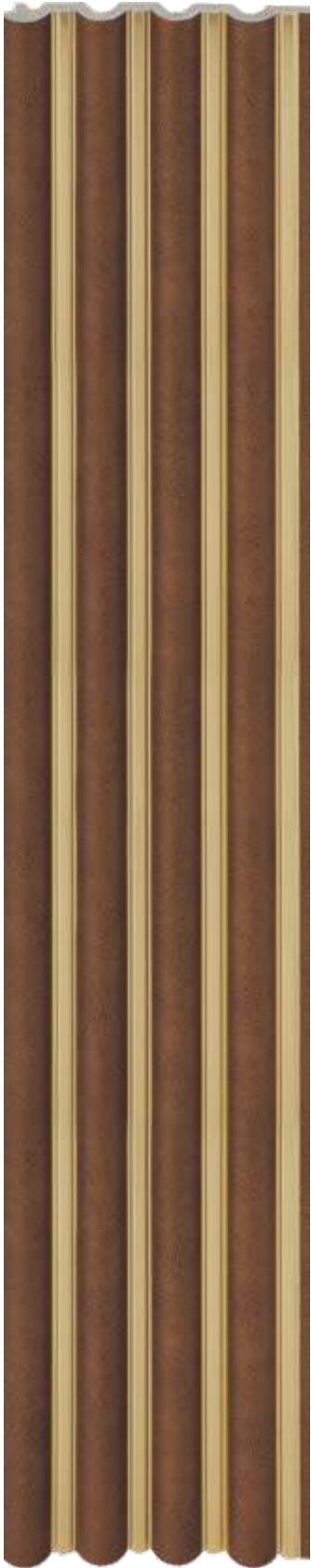
LP - 6003 / 10