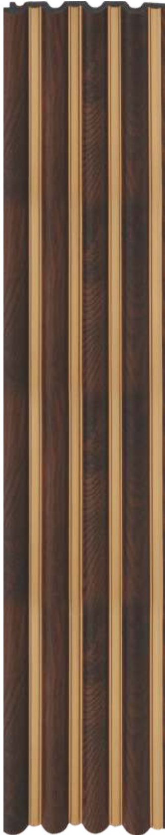
LP - 6003 / 11