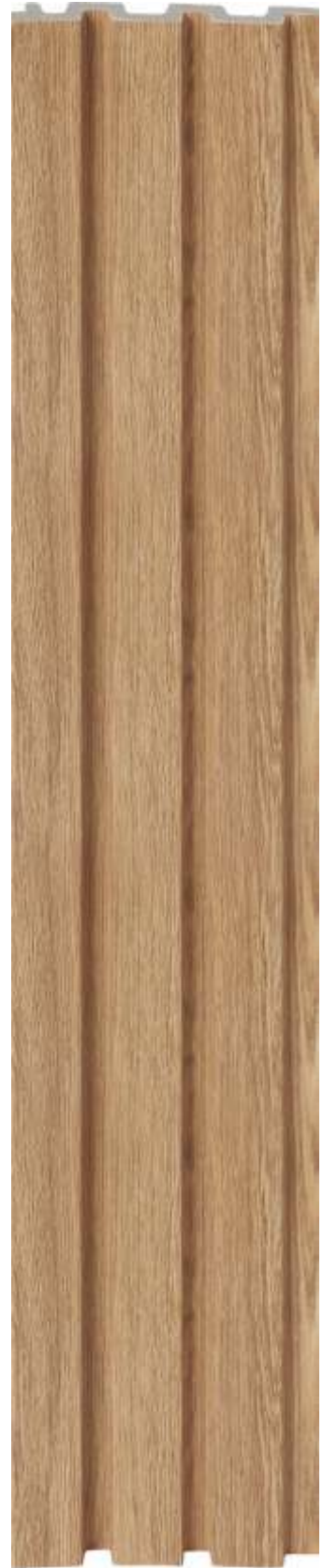
LP - 6002 / 17