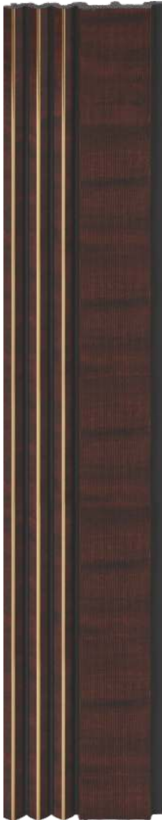
LP - 6001 / 11