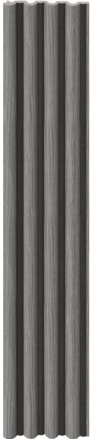
LP - 6003 / 15