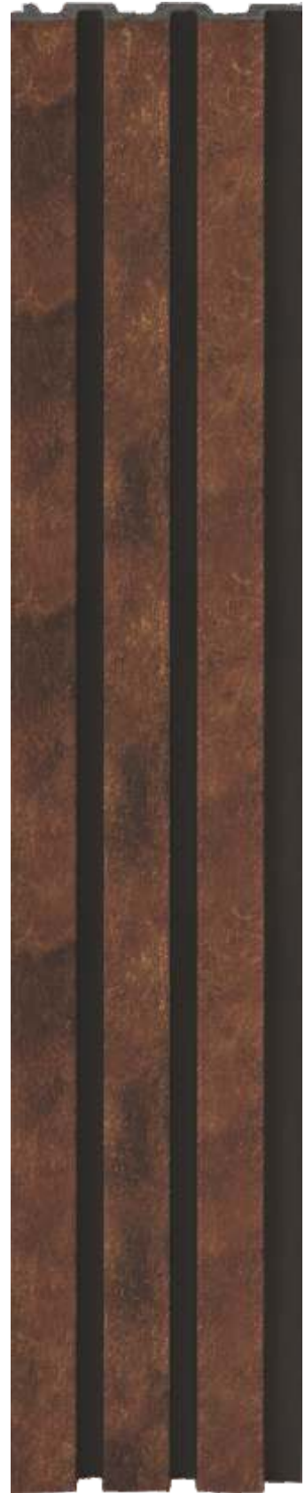
LP - 6002 / 9