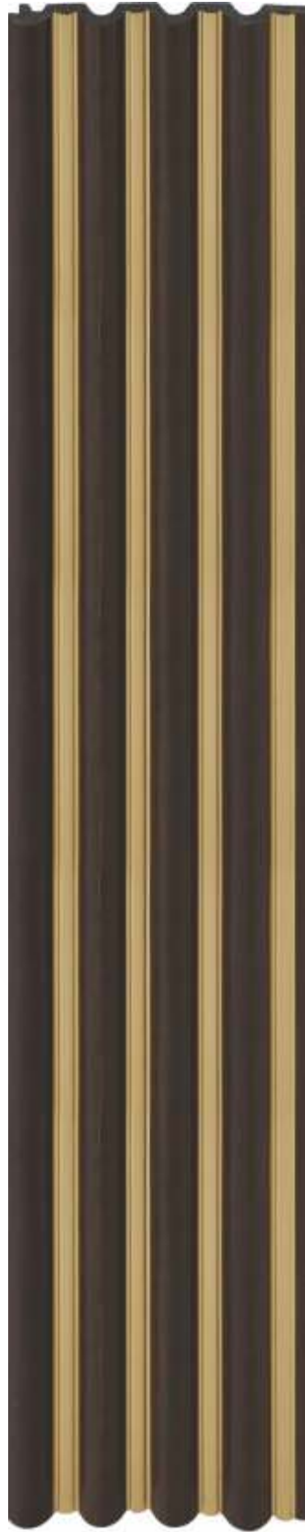
LP - 6003 / 16