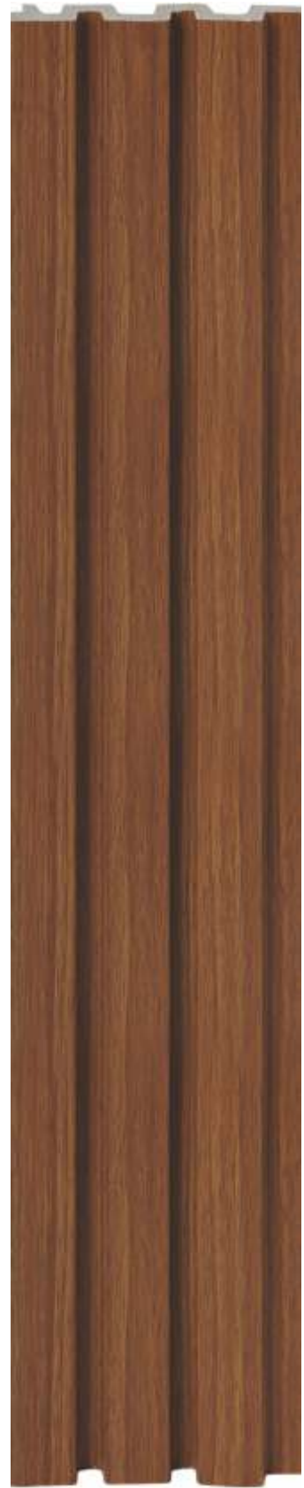
LP - 6002 / 12