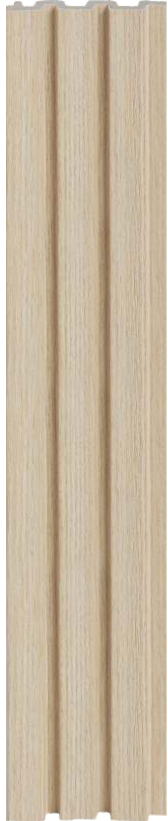
LP - 6002 / 6