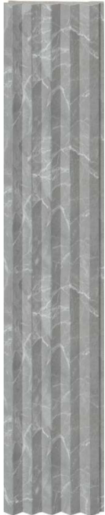
LP - 6004 / 15