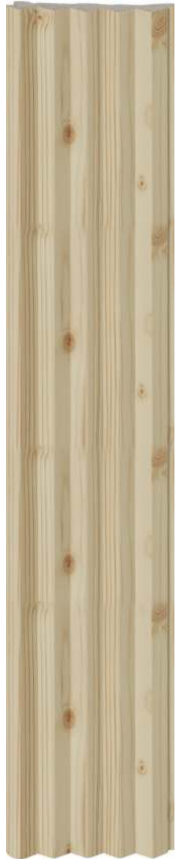
LP - 6004 / 18