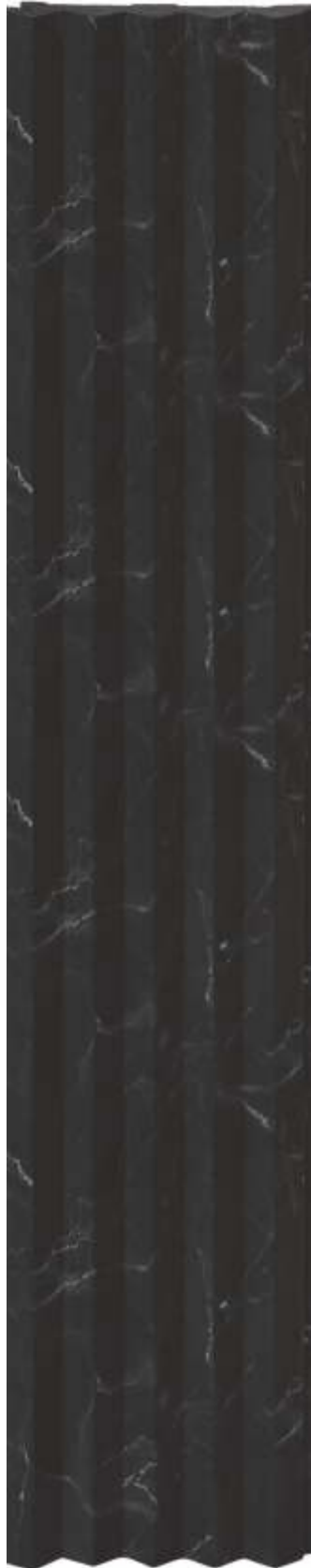
LP - 6004 / 14