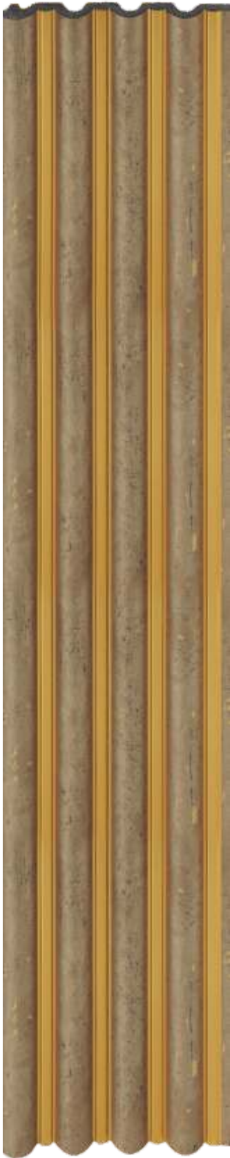
LP - 6003 / 4