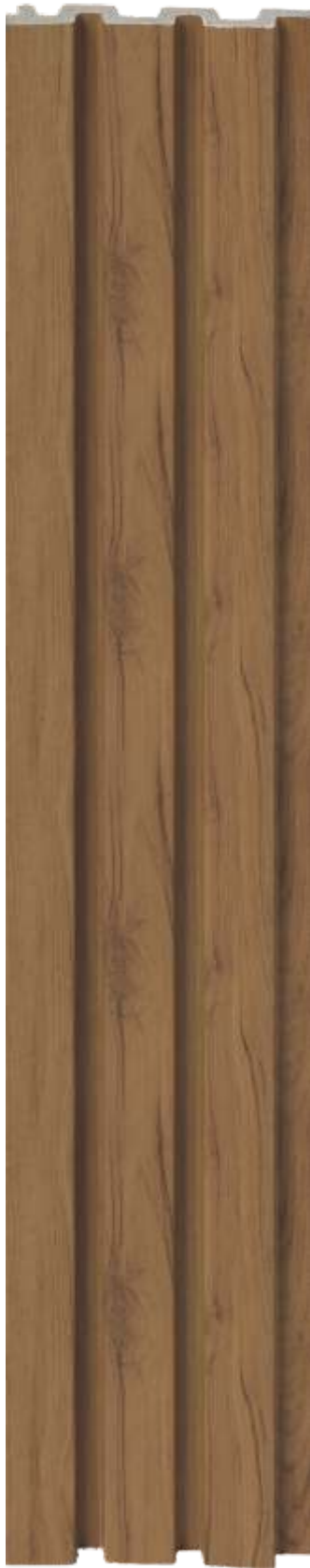
LP - 6002 / 8