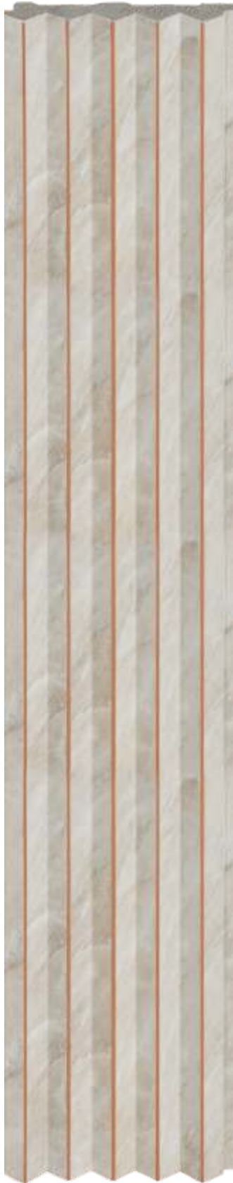
LP - 6004 / 11