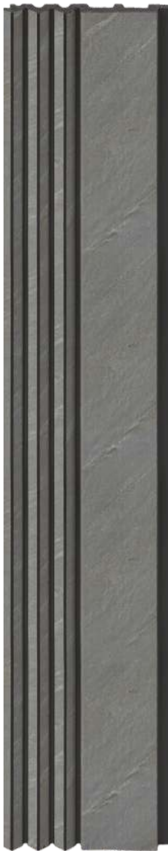
LP - 6001 / 5