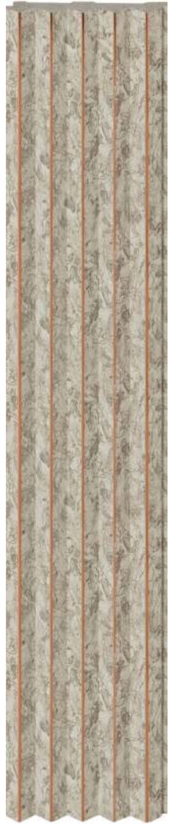
LP - 6004 / 26