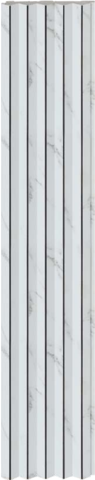
LP - 6004 / 1