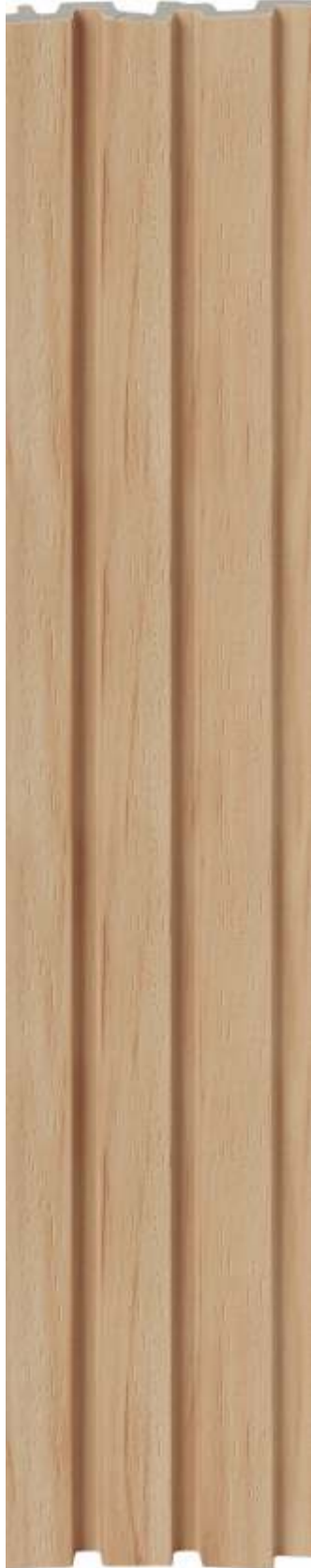
LP - 6002 / 14