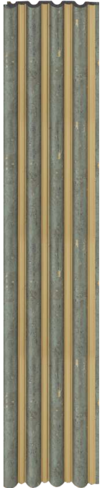
LP - 6003 / 3