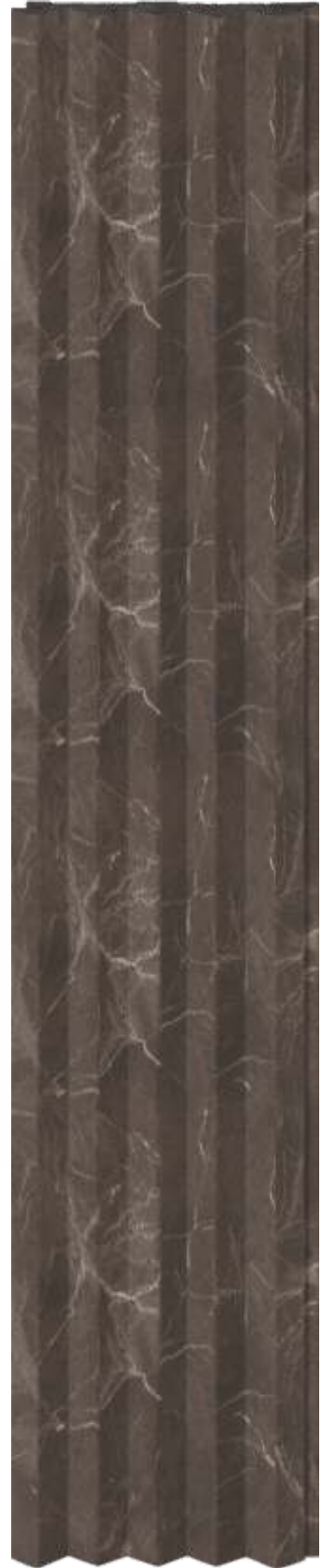
LP - 6004 / 6